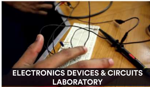
ELECTRONICS DEVICES & CIRCUITS LABORATORY