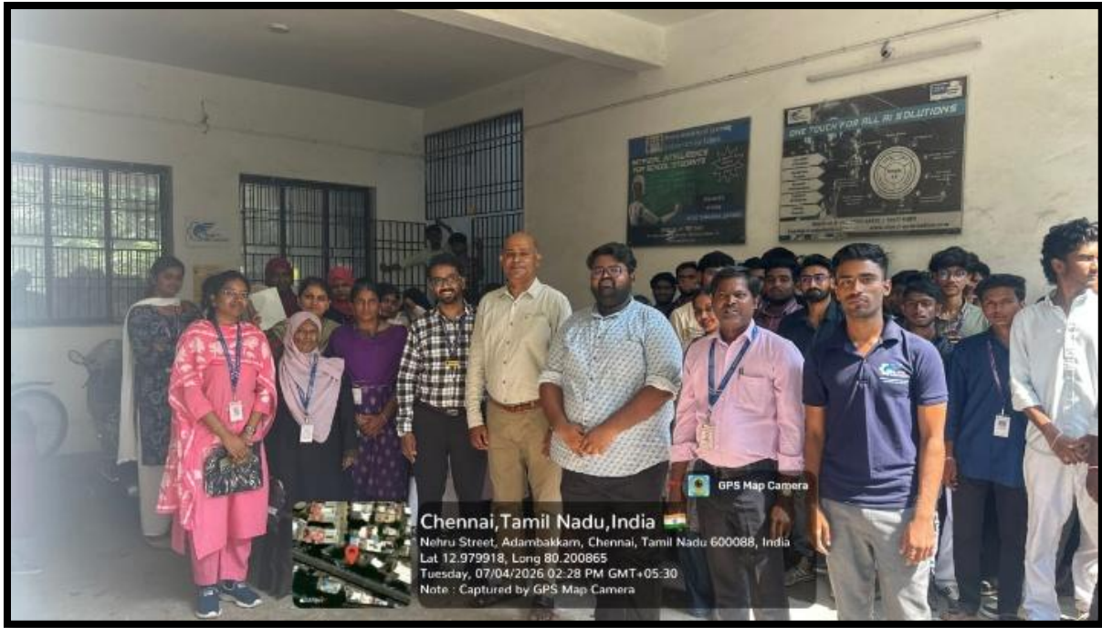
Chennai, Tamil Nadu, India Nehru Street, Adambakkam, Chennai, Tamil Nadu 600088, India Lat 12.979918, Long 80.200865 Tuesday, 07/04/2026 02:28 PM GMT+05:30 Note : Captured by GPS Map Camera