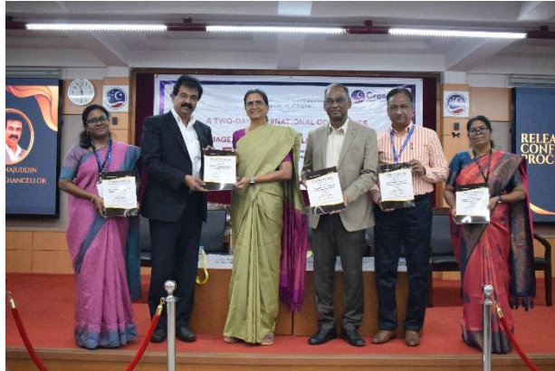
Release of the Conference Proceedings