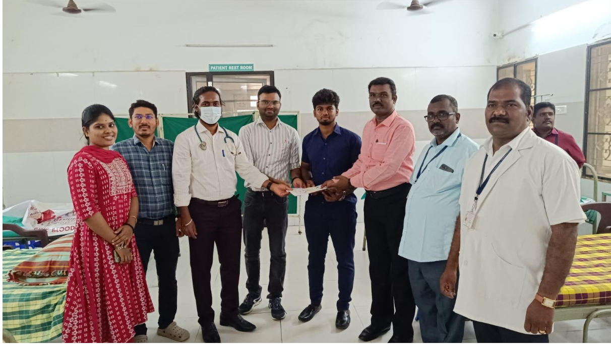
Distribution Blood donation certificate to the donor