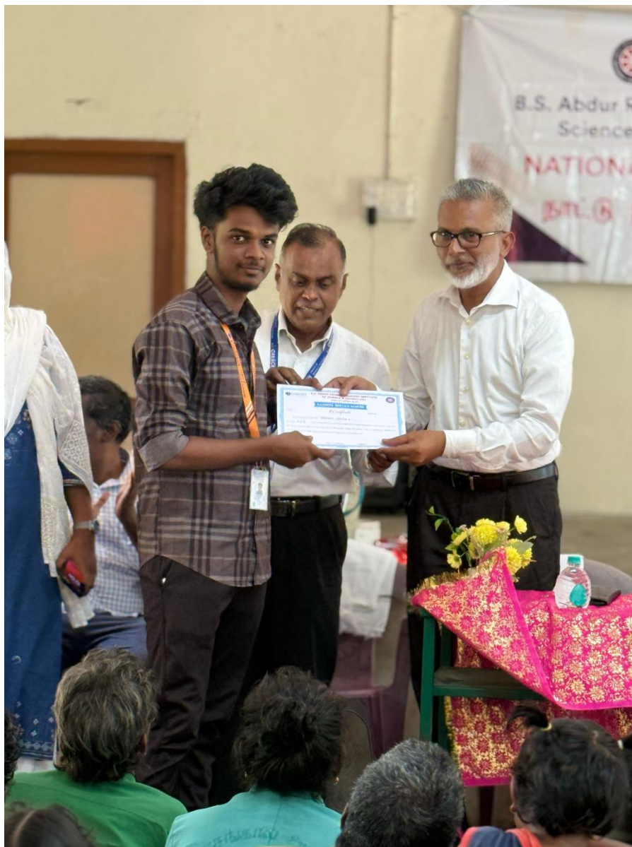
Special Camp Certificate awarded to NSS volunteers