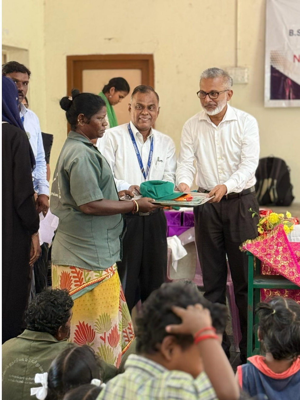
Sanitary kit given to workers