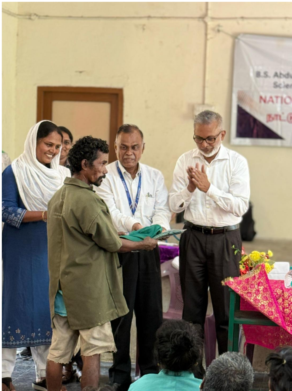
Sanitary kit given to workers

B.S. Abdur Rahman™ Crescent Institute of Science & Technology Deemed to be University u/s 3 of the UGC Act, 1956