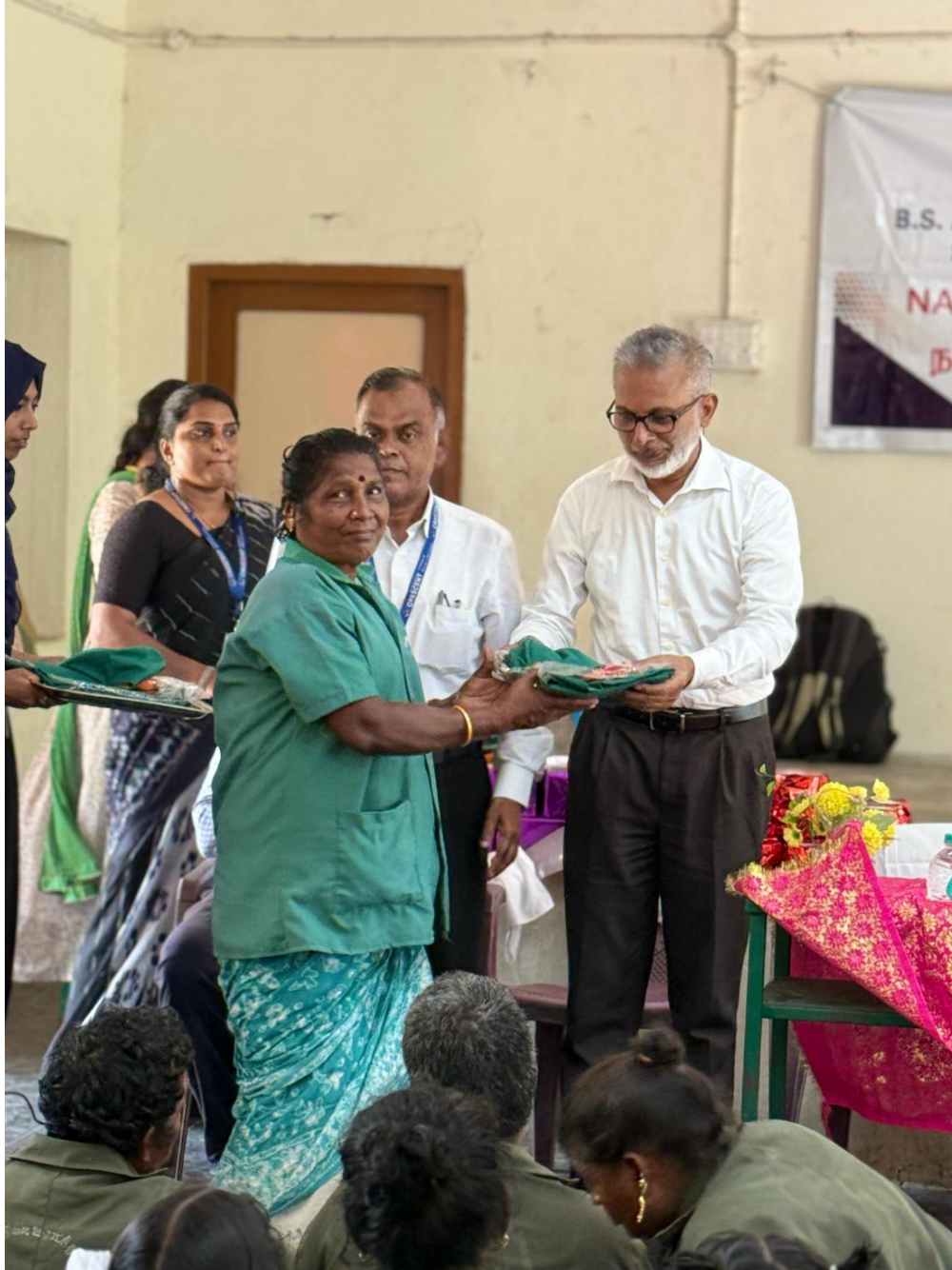
Sanitary kit given to workers