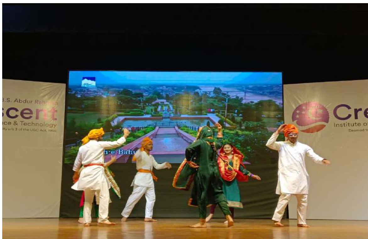
Jammu and Kashmir team