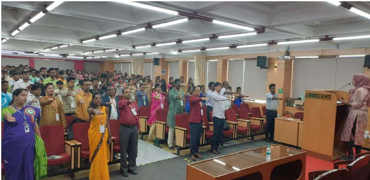
Participants Pledge Commitment: Taking an Oath during the session

The audience at the National Integration Camp resonated with Ms Ayesha's powerful message, acknowledging the significance of addressing climate change as a collective responsibility. Her insightful session prompted discussions on the role of youth in driving sustainable practices and policy changes.