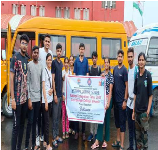
RAJASTHAN TEAM IN CENTRAL STATION RECEIVED BY OUR NSS VOLUNTEERS