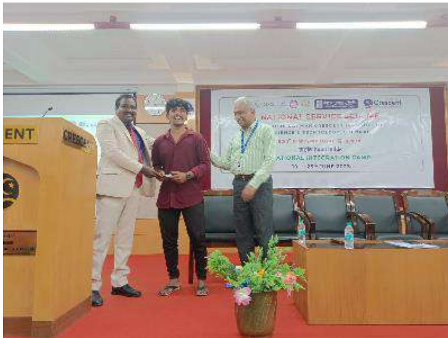
Participant was awarded by cash prize during the session

In the evening session, NSS volunteers of BSA Crescent Institute of Science and technology exhibited their extracurricular talents through cultural programmes like traditional dance – Bharathanatyam, Fusion dance, Music with band and Silambattam.