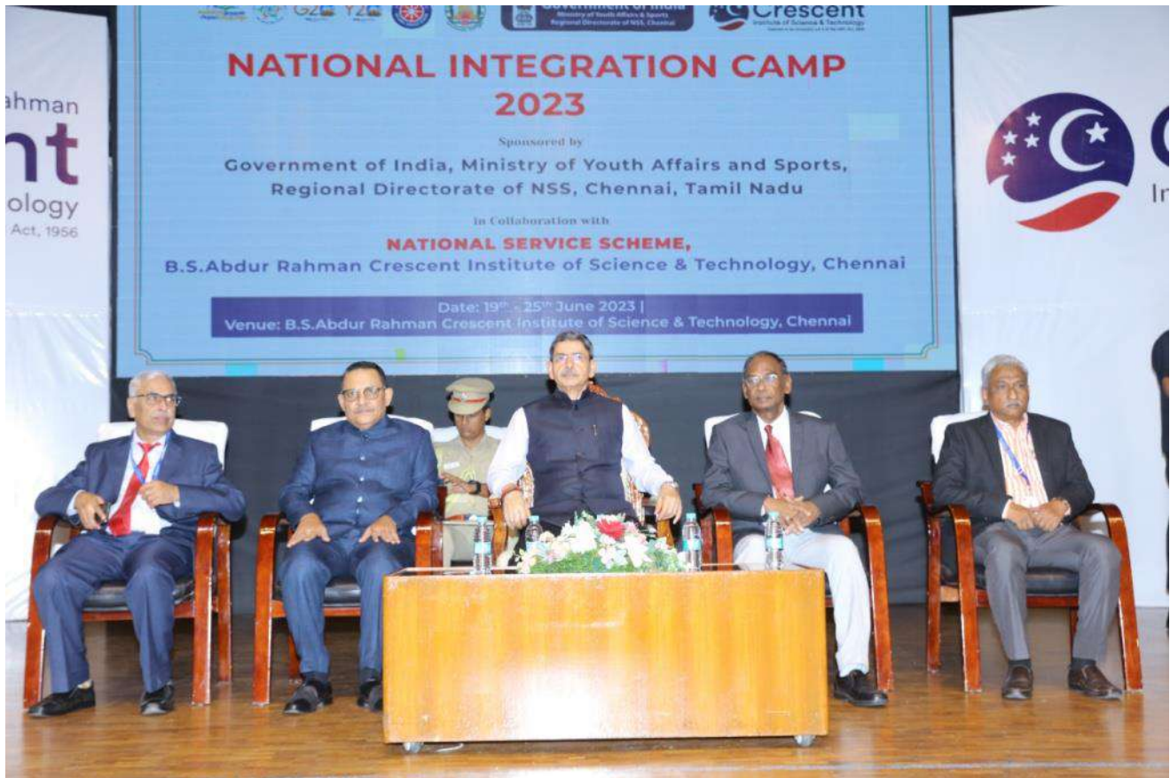
Inaugural Event in Presence Of H'ble Governor