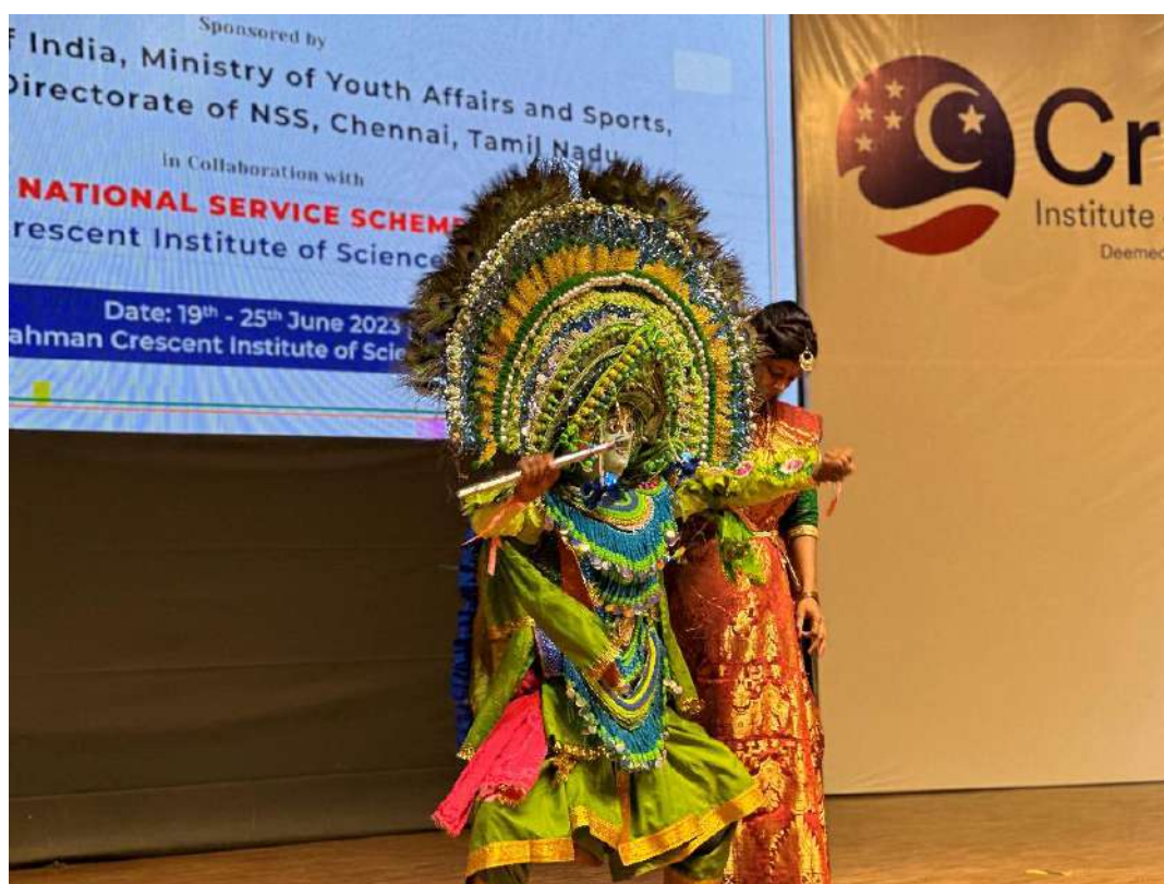
West Bengal Team

The Day 2 cultural program at the National Integration Camp featured captivating performances from Andhra Pradesh, Maharashtra, and West Bengal. The event showcased the diverse cultural heritage of these states, with Andhra Pradesh presenting Kuchipudi dance, Maharashtra showcasing Lavani folk dance, and West Bengal mesmerizing the audience with a soulful traditional song. The performances exemplified the camp's commitment to cultural diversity and fostered a sense of appreciation among participants. The highlight of the evening was West Bengal's enchanting Chhau Dance, which skillfully portrayed mythical stories and showcased the state's artistic brilliance. The performances left a lasting impression, emphasizing the importance of preserving and celebrating India's rich cultural traditions.