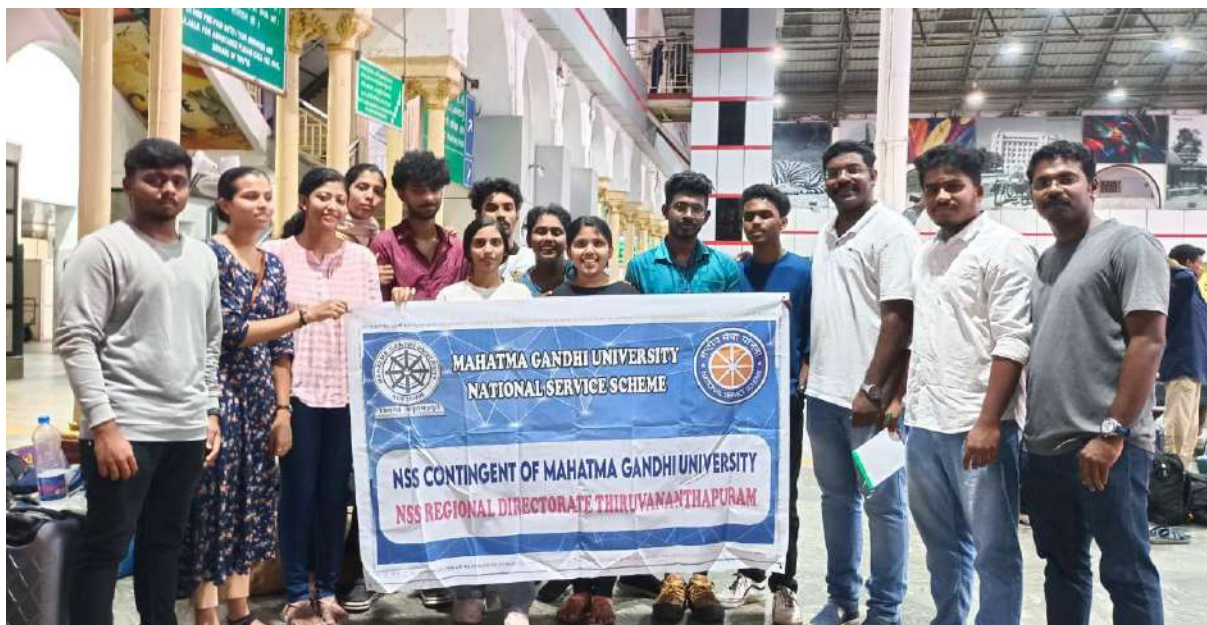
KERALA TEAM IN CENTRAL STATION RECEIVED BY OUR NSS VOLUNTEERS