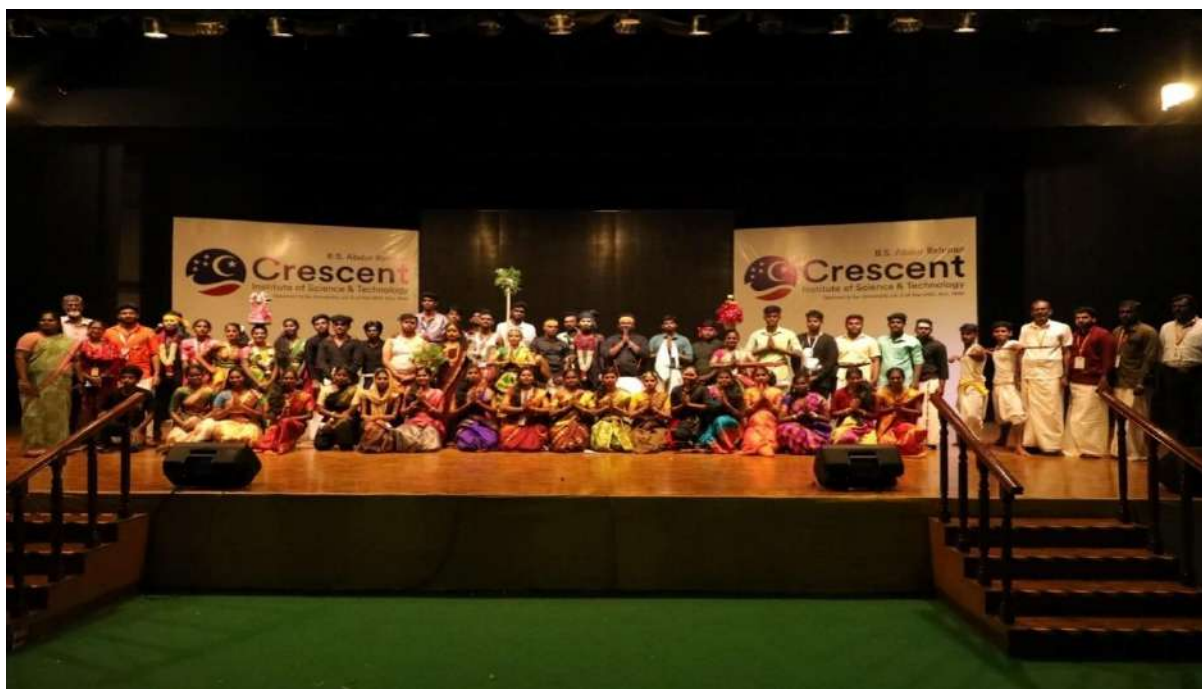
Group Photo with All team (NIC Volunteers)

The last team from the Land of Culture (Tamil Nadu) came to perform the introduction to the Tamizh language and its culture. They gave an assortment of dances like Bharathanatiam, Dandura, Kambam, festival celebration, Kummi, Karakattam, Oyilattam, Lezim, and Maatu Kombu, Kattakaal, Silambattam, Folk dance, Amman dance, and Group dance. It was an incredible execution. The evening had a nice finish, as it turned out. They danced and performed a lovely choral recitation to round off the evening.