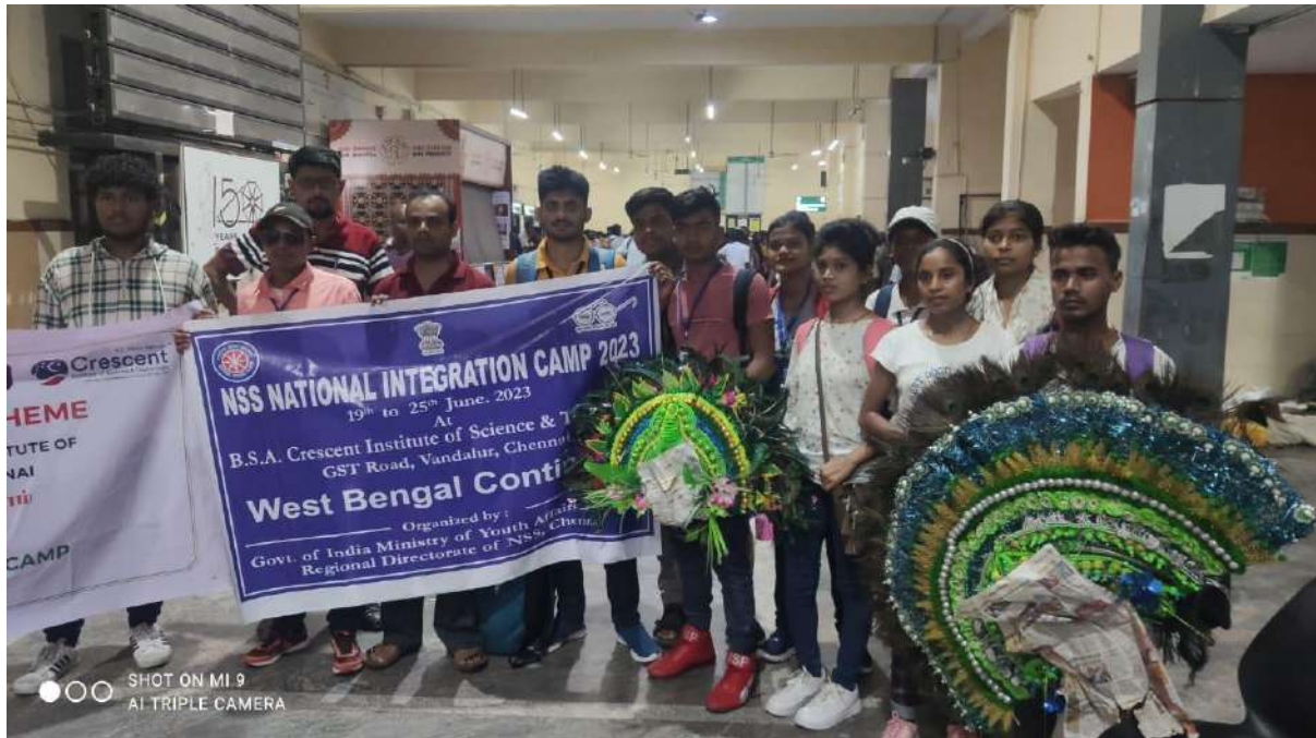
WEST BENGAL TEAM IN CENTRAL STATION RECEIVED BY OUR NSS VOLUNTEERS