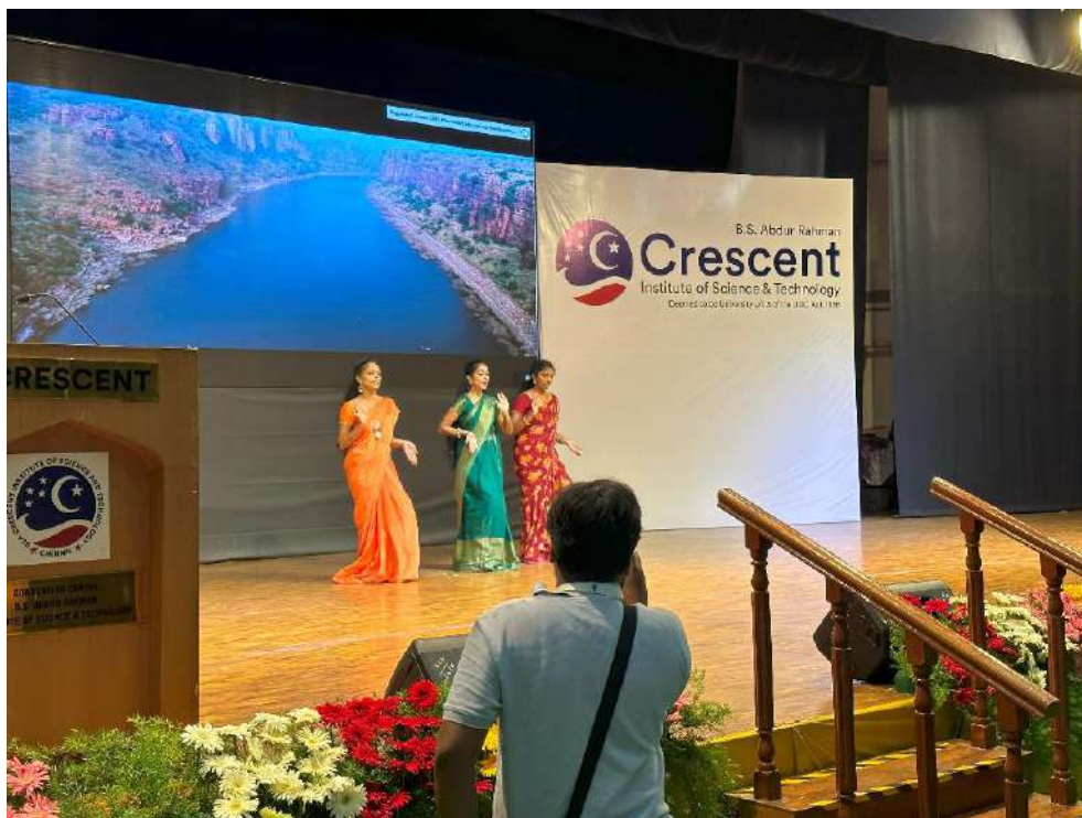
Andhara Pradesh Team