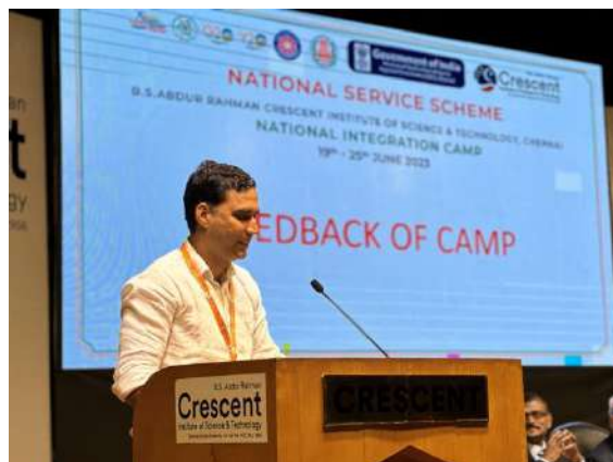
Feedback session of camp by student volunteer of Kerala and JK PO