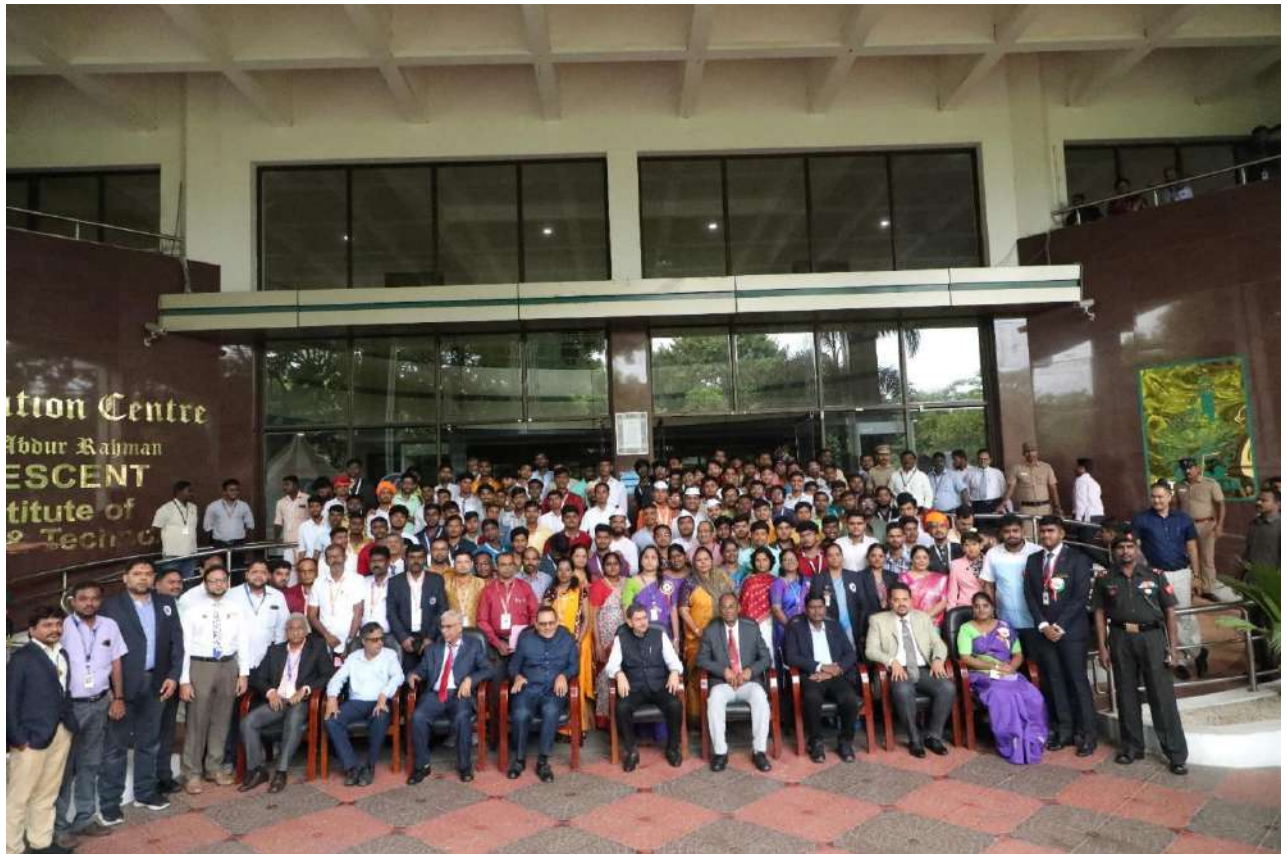
Group Photo with Hon'ble Governor, District Collector, NSS State Head Officers, Chancellor, Vice-Chancellor, Registrar, NSS Coordinators and NSS volunteers