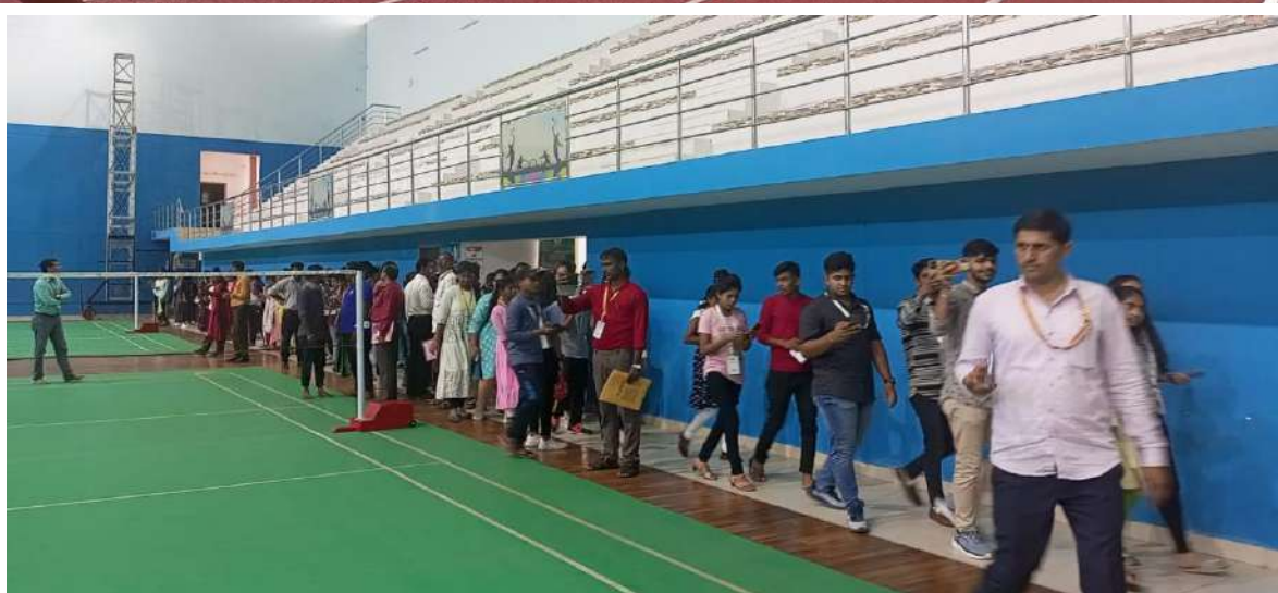
Participants of National Integration Camp Visit Tamil Nadu Physical Education and Sports University