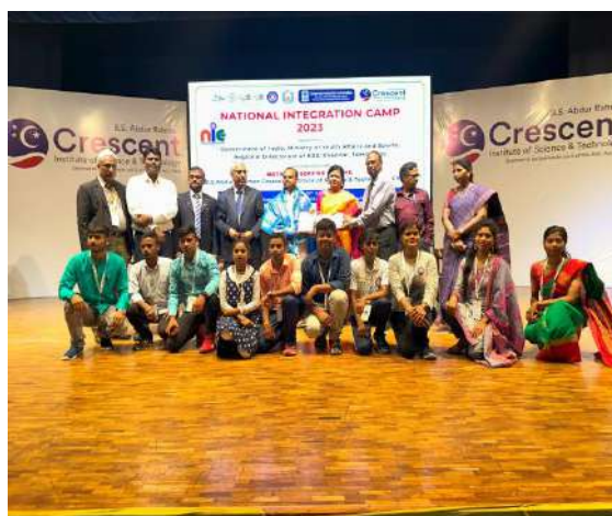
Honoring the Pos and distribution of certificates