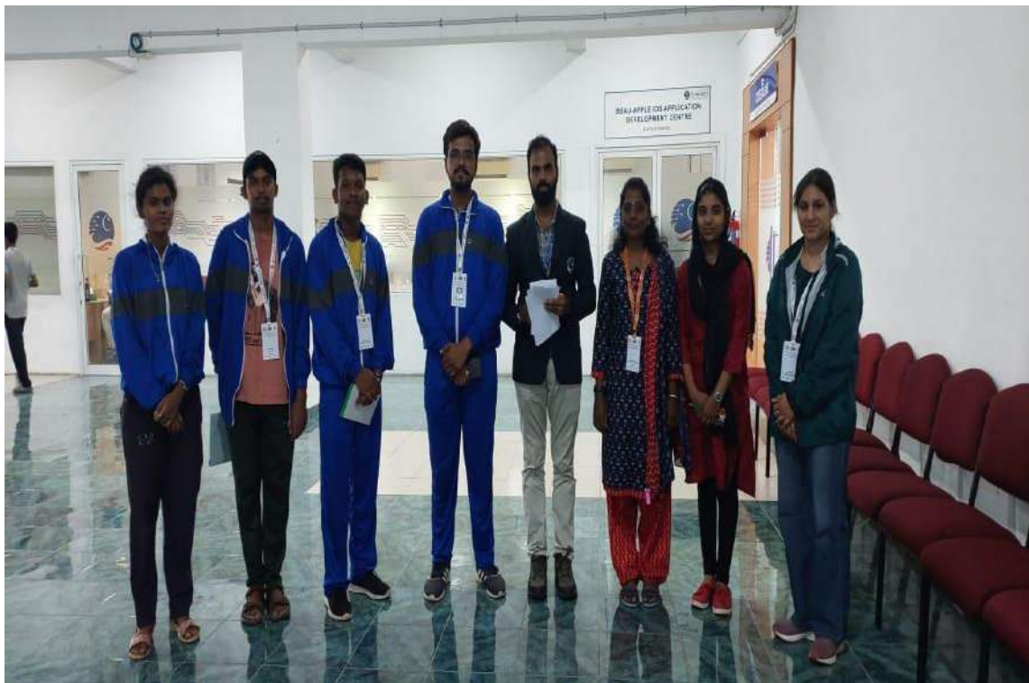
Laissez – Fire Team