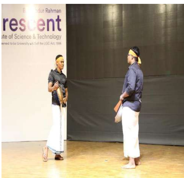
Parraiyaattam @ Dhanura