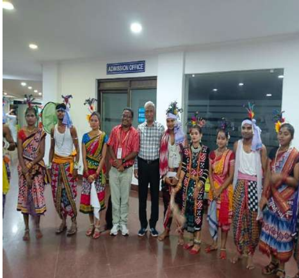
Odisha NIC Volunteers