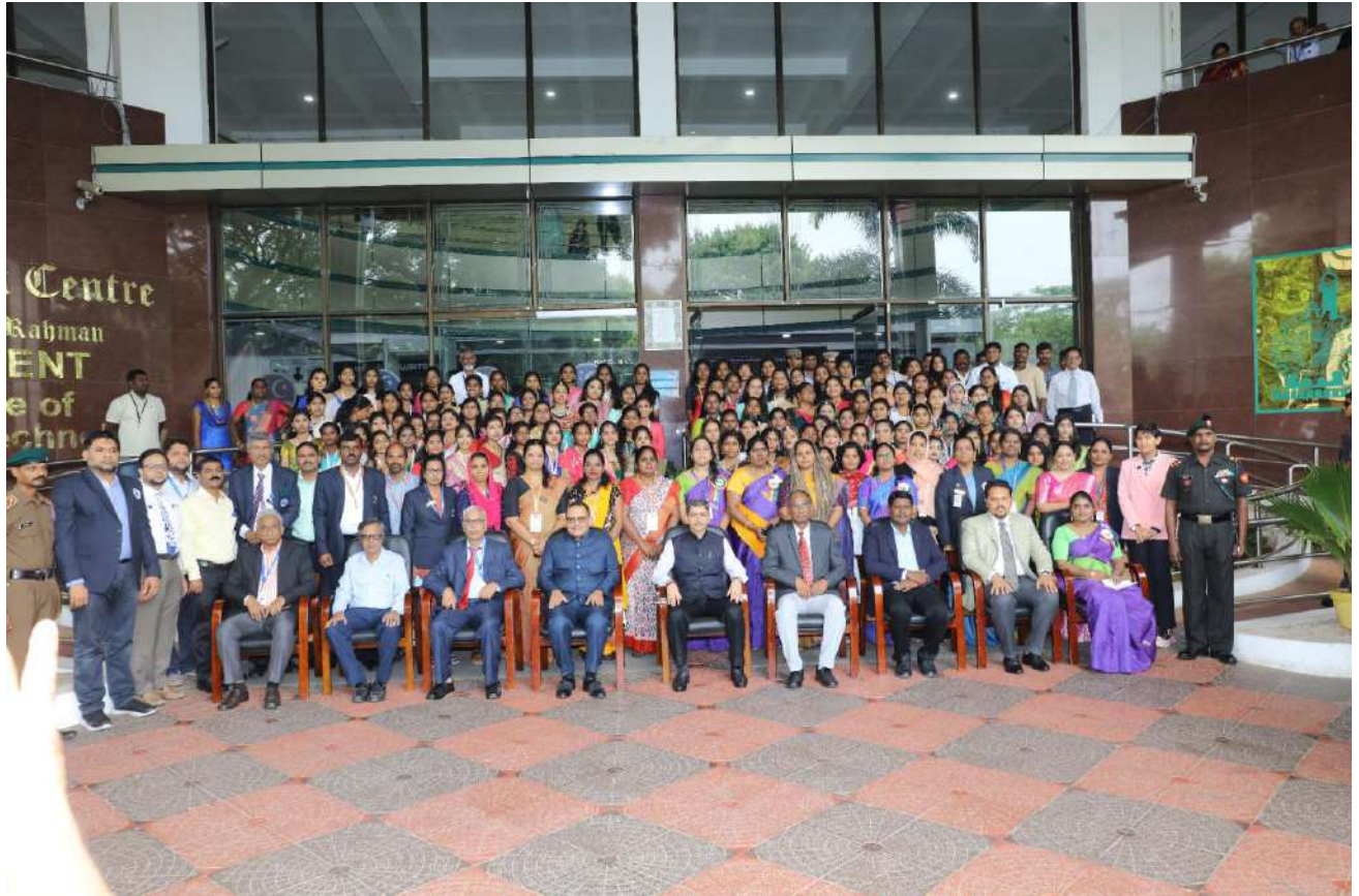
Group Photo with Hon'ble Governor, District Collector, NSS State Head Officers, Chancellor, Vice-Chancellor, Registrar, NSS Coordinators and NSS volunteers