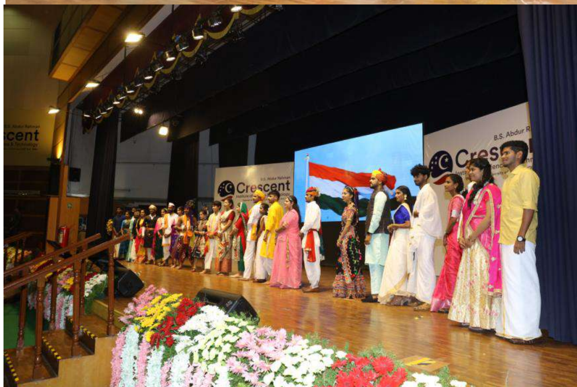
Showcase of National Integration in inaugural session