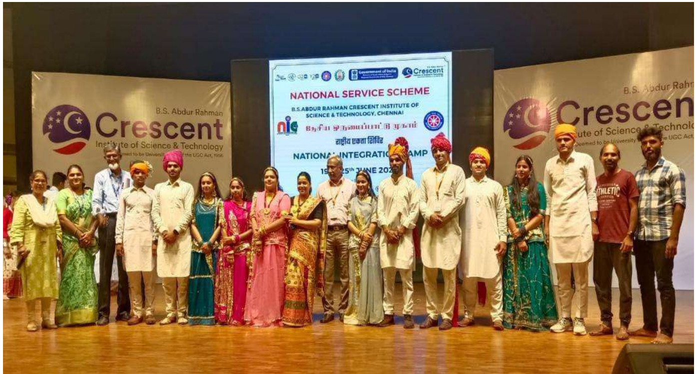
Rajasthan NIC Volunteers