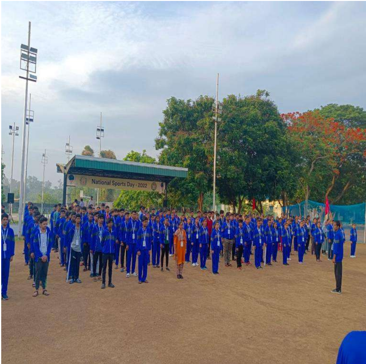
Morning Exercise by NSS coordinators and NSS Volunteers