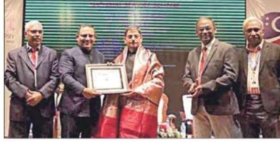
➔ பி.எஸ்.அப்துர் ரஹ்மான் கிரசன்ட் அறிவியல் தொழில்நுட்ப நிறுவனத்தில் நடைபெற்ற என்எஸ்எஸ் முகாமில் ஆளுநர் ஆர்.என்.ரவி பங்கேற்றார்.

இம்முகாமில் பல்வேறு நாட்டு நலத்திட்டப் பணிகள் நடைபெற்றன. மரம் நடுதல், ரத்த தானம், தூய்மைப்பணி, யோகா போன்ற நிகழ்வுகள் மேற்கொள்ளப்பட்டன. மேலும் ஆளுமைத் திறன், பருவநிலை