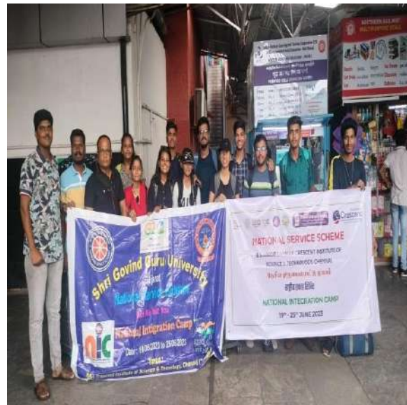
GUJARAT TEAM IN CENTRAL STATION RECEIVED BY OUR NSS VOLUNTEERS