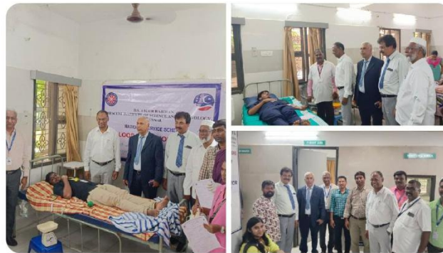
NSS India and 2 others

NSS of @bsacrescentinst organized a Blood donation camp on 21st September & donated 106 units of blood to The Tamil Nadu Dr.M.G.R. Medical University. #BloodDonation #BloodDonationlifesaving