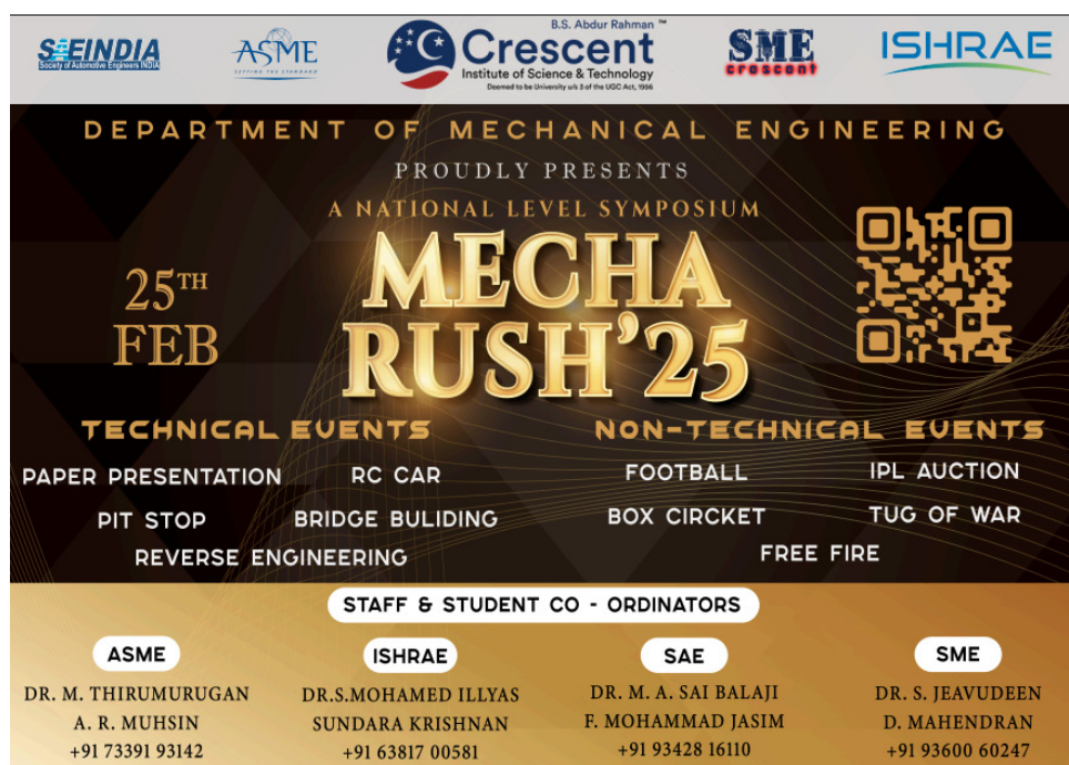
Mecha Rush 2K25 Poster

The students from different institutions participated in the events. The faculty and student coordinators of the societies were actively involved. The winners and participants of the respective events were awarded with prizes and certificates during the valedictory function.