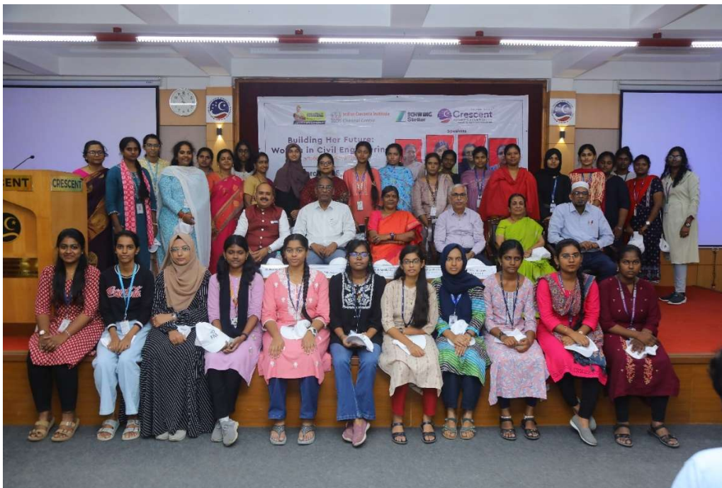
Group Photo Session with the participants