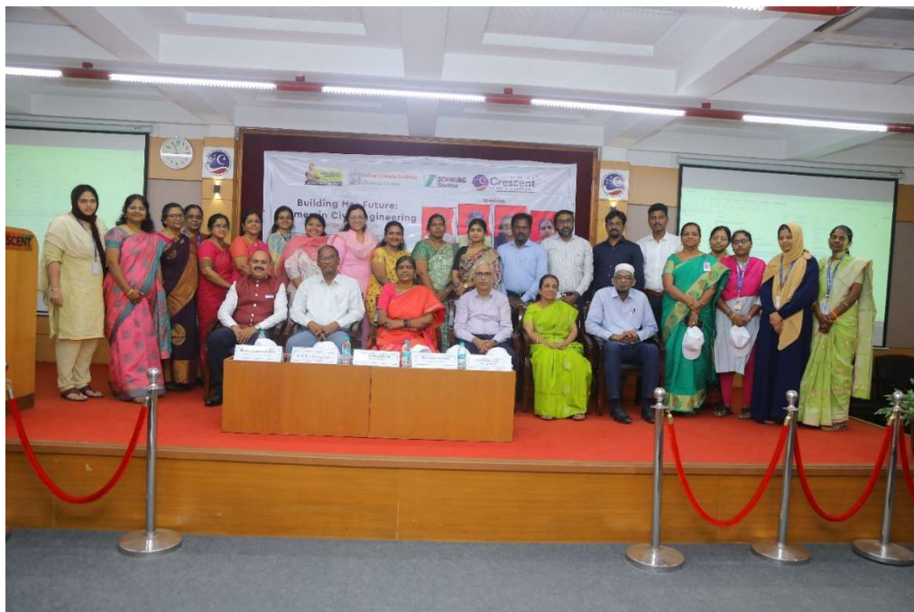
Group Photo Session with Faculty from various Institutions and Industry Personnel