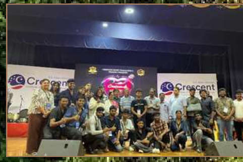
Crescendo'25 page 02