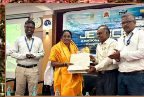
Jetscreech'25 page 04