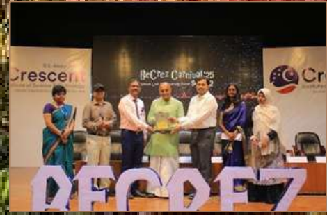
BeCrez Carnival'25 page 03