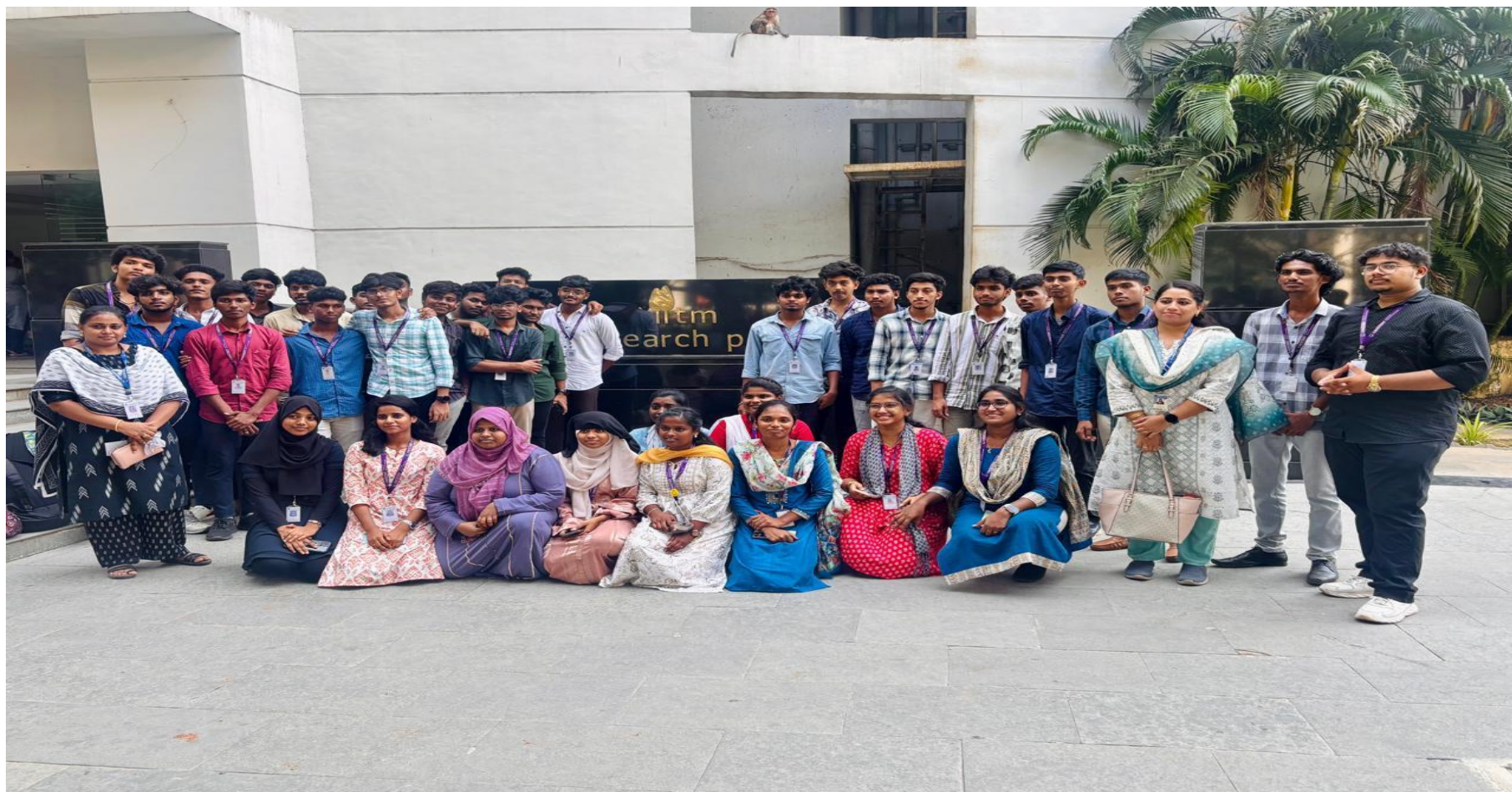
Students of BCA CTIS & CS, Semester - 2