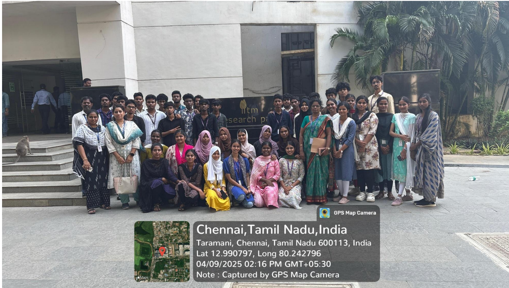
Students of B.Sc. Computer Sciences, Semester - 2

Photos taken on the session are follows: