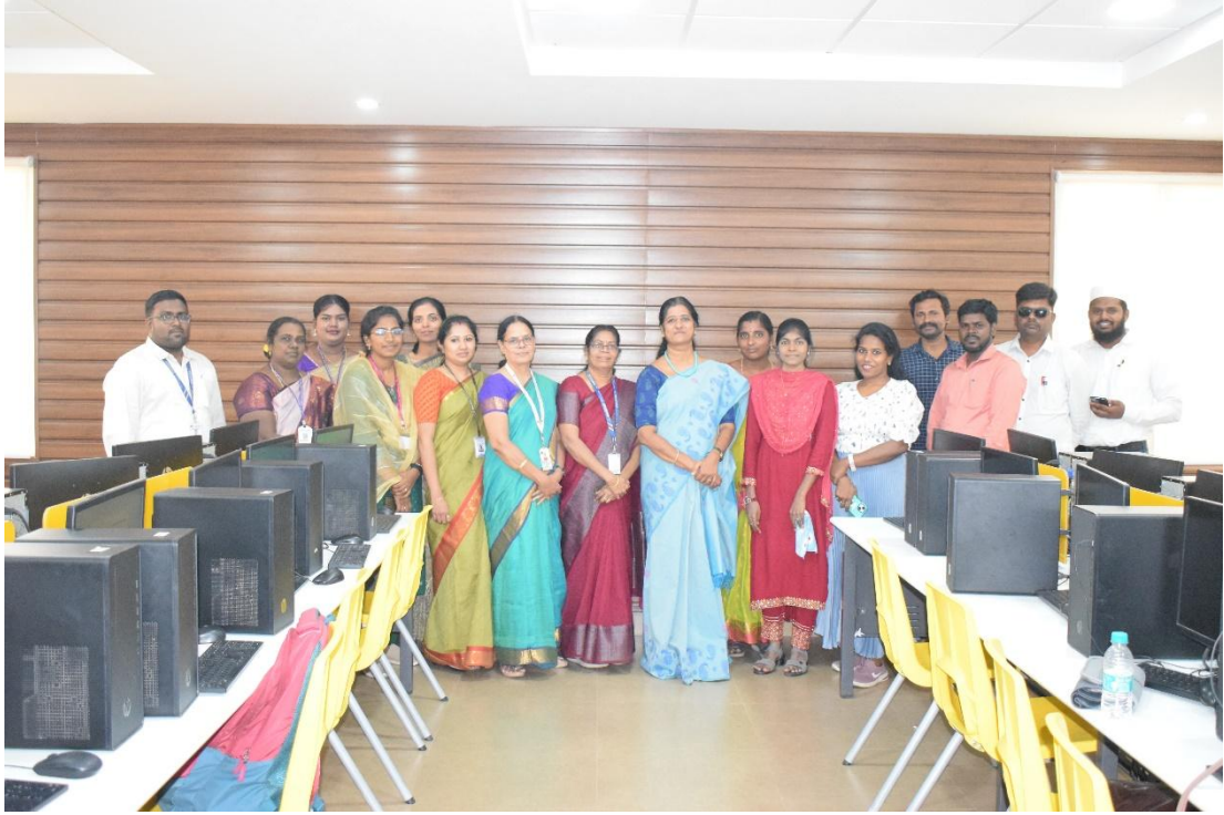
HoD, Resource Person with the participants