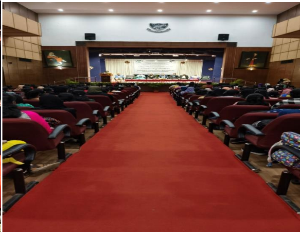
Glimpse of international conference