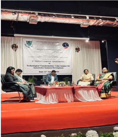
Panel discussion by industry experts