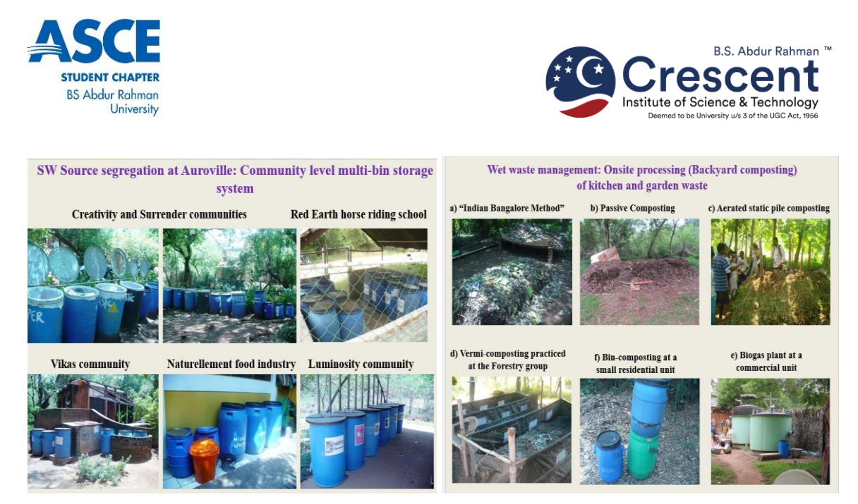
Fig 2: Types of Waste segregation system and Onsite composting

Dr.R.Rajamanikam also emphasized the necessity for developing an awareness among the people with respect to onsite compositing of food waste at the individual homes. The initiatives taken by the government to promote such activities in association with NGOs were elaborated and it was very much informative for the students.