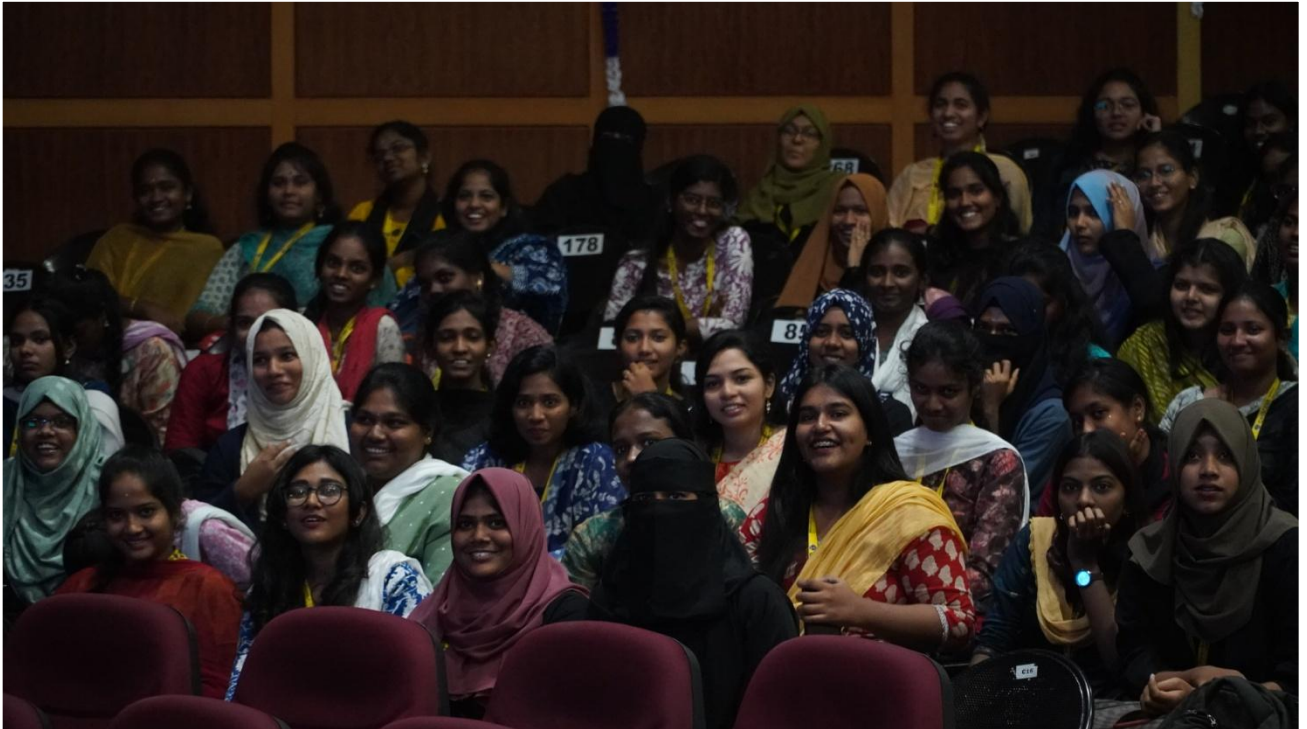
Aspirants of the program are listening with interest and joy