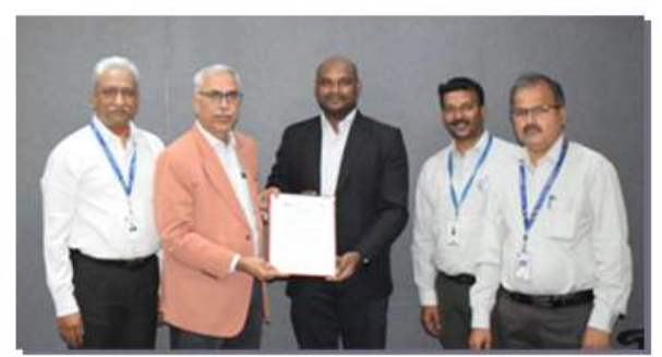
MoU with ISDC, UK