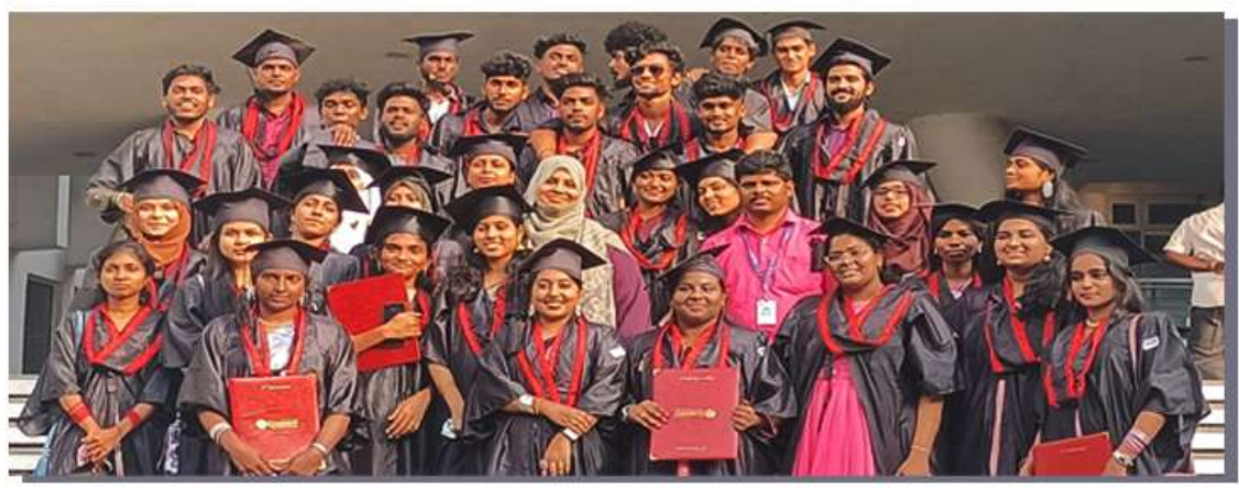
B.Com Hons students Graduate