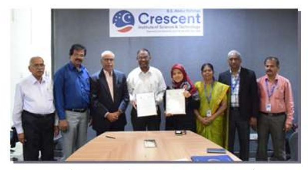
MoU with Universitas Islam Bandung (Unisba), Indonesia