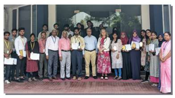
ACCA Students Felicitation ceremony