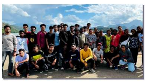
Industrial visit to Kanthallur, Kerala III<sup>rd</sup> B.Com Hons