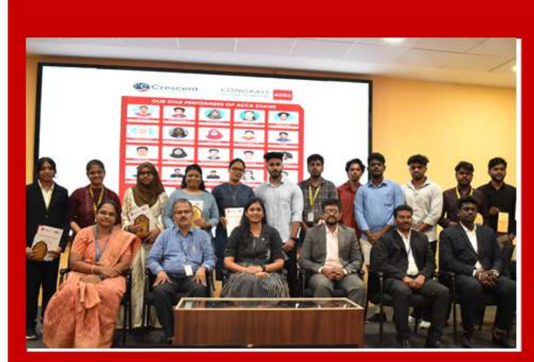
ACCA Felicitation Program 2024