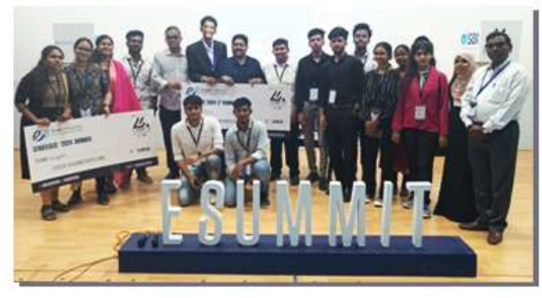
B.Com Hons Students partipated in IIT-M Entrepreneurship Summit