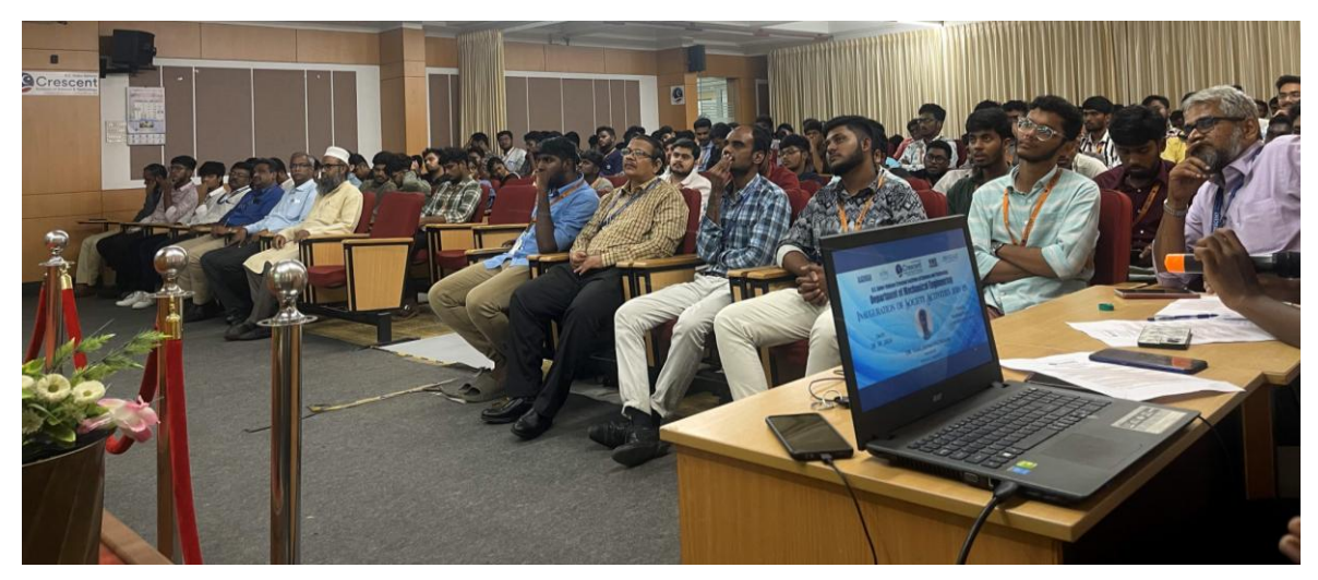
Page 7 of 7