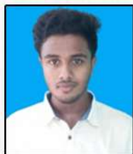
Surya K Avasoft 5L