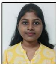
Divya Cognizant 4L