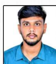
Sirajudeen Avasoft 5L