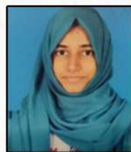
Saniya Mirza Survey Sparrow 7L