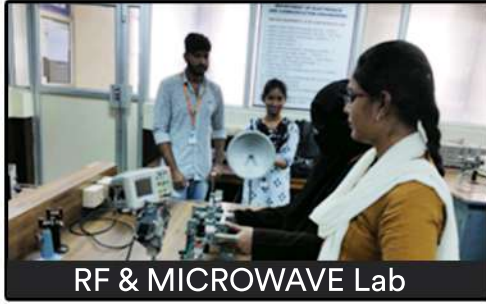
RF & MICROWAVE Lab