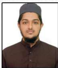
Fadhl ur Rahman JSW 9.5L