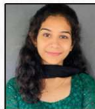
Thummagunta Vedha Sree LTI 4L