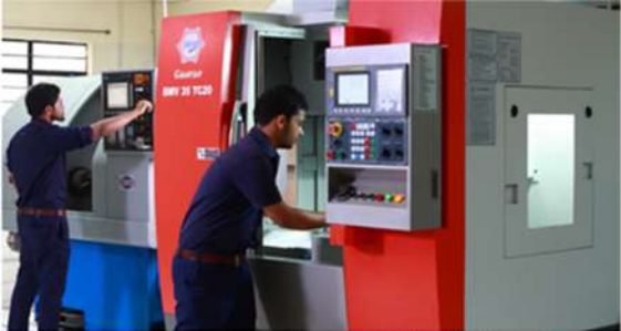
CNC Turning Center, Vertical Machining Center