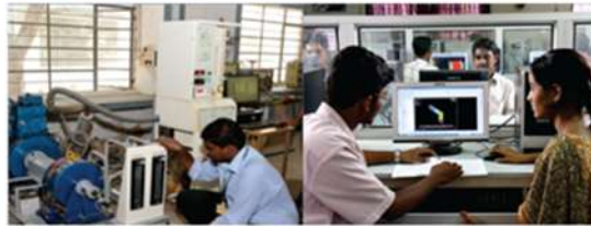
Engine Exhaust Emission Tester CAD Lab