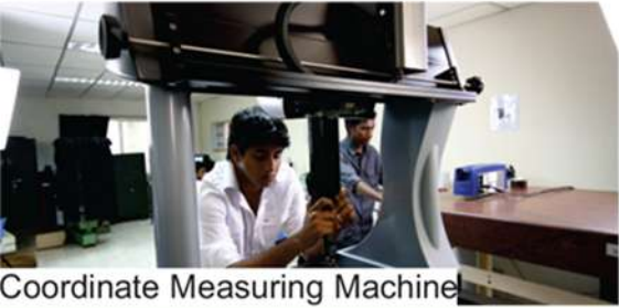
Coordinate Measuring Machine