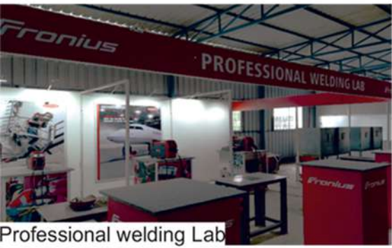
Professional welding Lab