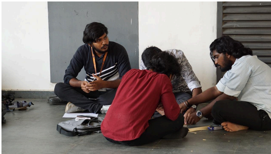
Design calculations by the participants