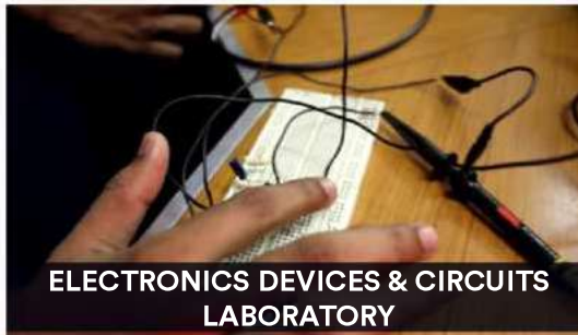
ELECTRONICS DEVICES & CIRCUITS LABORATORY