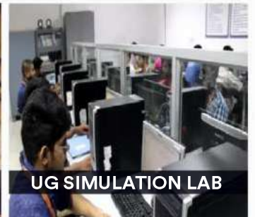
UG SIMULATION LAB