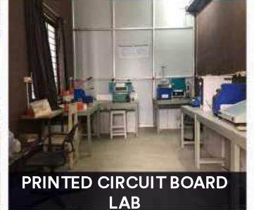
PRINTED CIRCUIT BOARD LAB