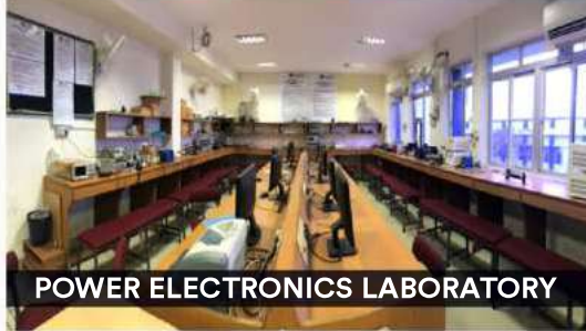
POWER ELECTRONICS LABORATORY