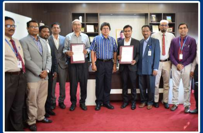
MOU with ISDC U.K