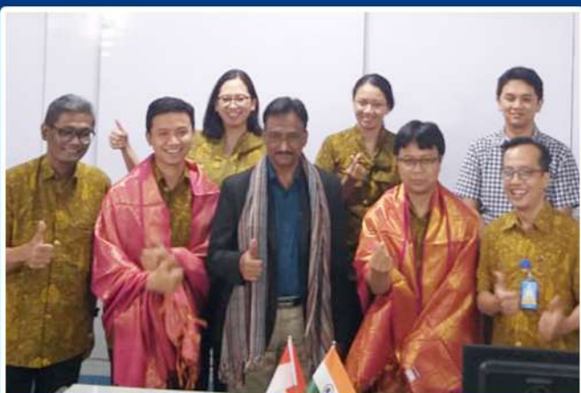
MOU with University Atma Jaya, Indonesia