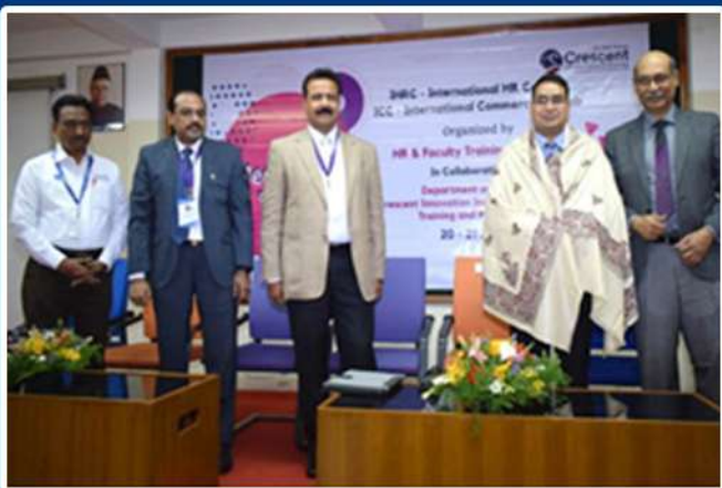
International Conference on HR CON FAB