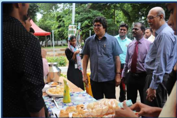
ED Cell Bazaar