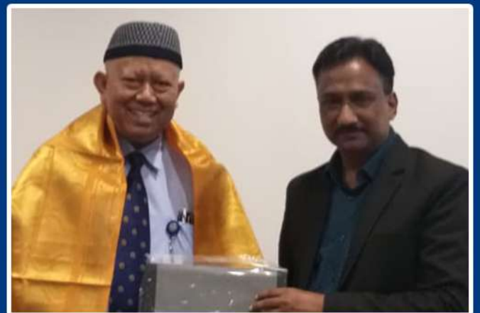
MOA With University Negeri , Indonesia