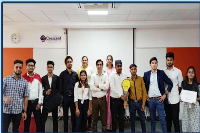
Management Games Team