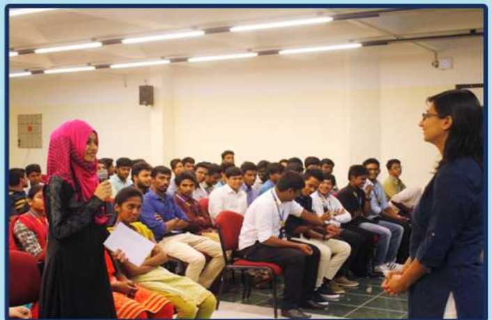
Guest Lecture on Finance