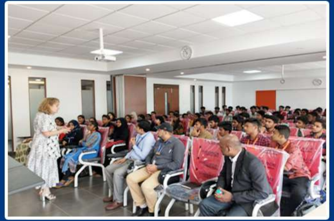
International Guest Lecture By ACCA Faculty