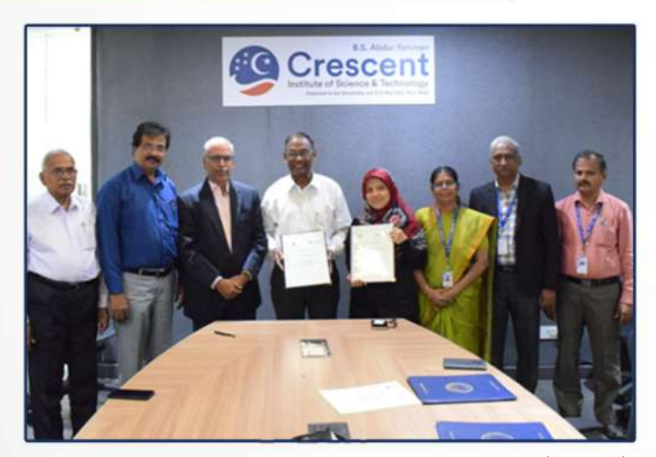
A Memorandum of Understanding (MoU) was signed between Universitas Islam Bandung (UNISBA), Indonesia and BSACIST to promote academic collaboration and exchange.