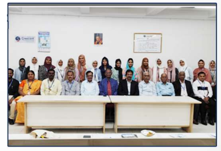
The Sullamussalam-Crescent Integrated Learning Exchange Programme, 'SCILEX,' commenced, emphasizing the importance of cultural exchange in discovering the humanity that unites us, transcending borders and differences.