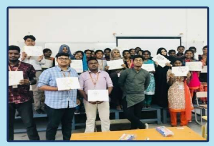
Workshop on Digital Marketing