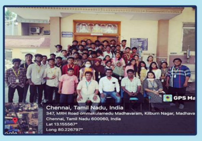
Industrial Visit to Parle-G Products Pvt.Ltd on 17th February 2024 (Biscuits Manufacturing Company)Madhavaram. Chennai.