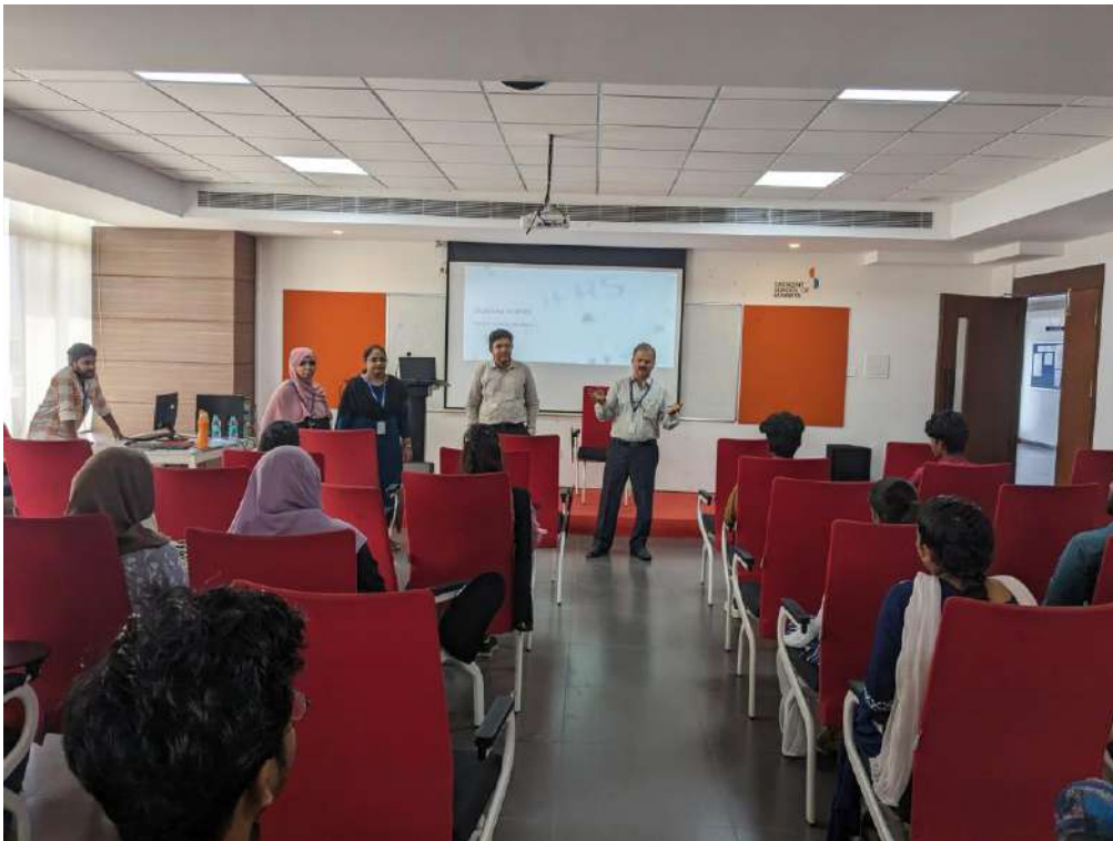
Figure 2 Head of the Department addressing the participants of Workshop