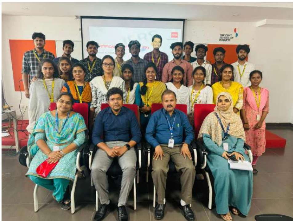
Figure 4 Group Photo with Trainer and Participants