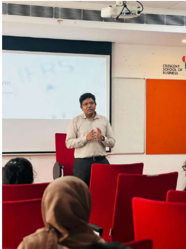
Figure 3 Training session glimpse