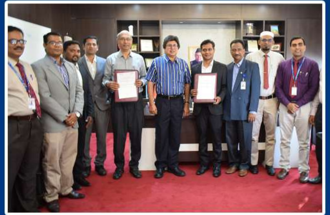
MOU with ISDC U.K