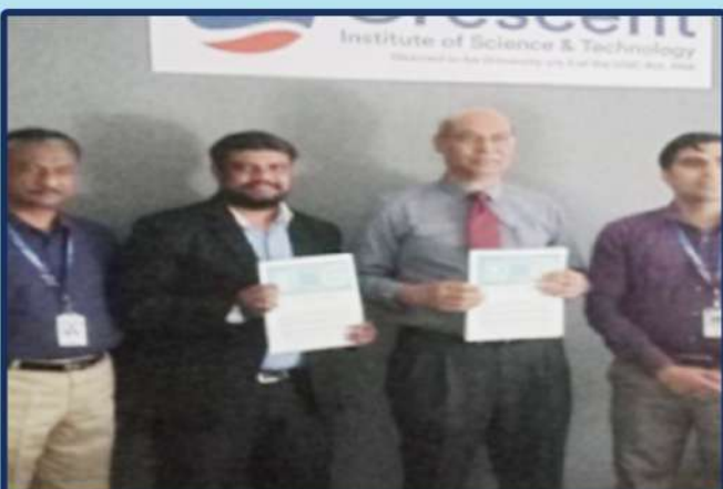
MOU with Miles Foundation