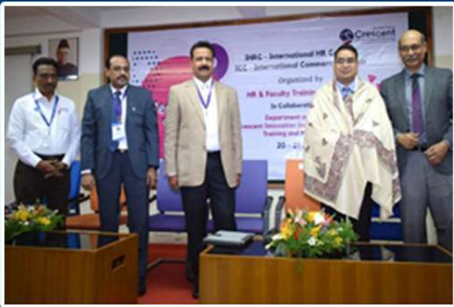
International Conference on HR CON FAB