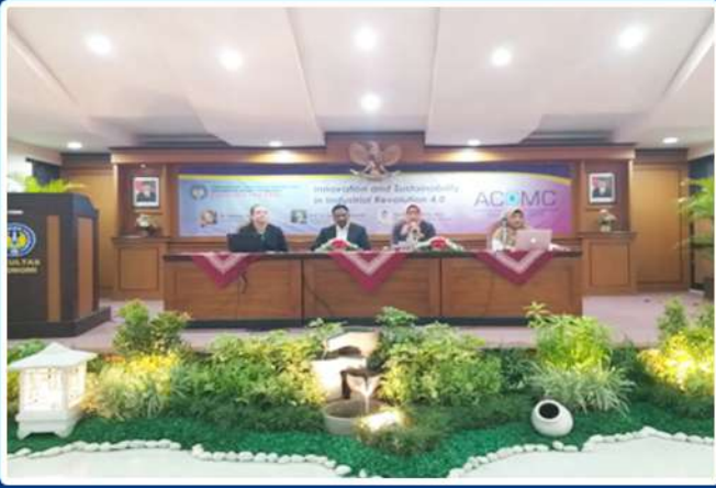
International Conference at University Negeri, Indonesia