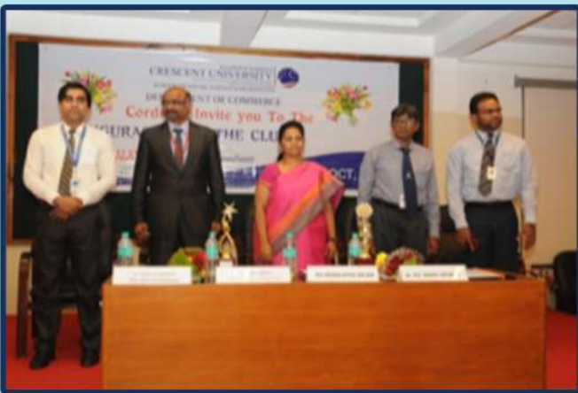
Inauguration of Commerce Club

The numerous departmental activities help unleash the latent skills and abilities of our students