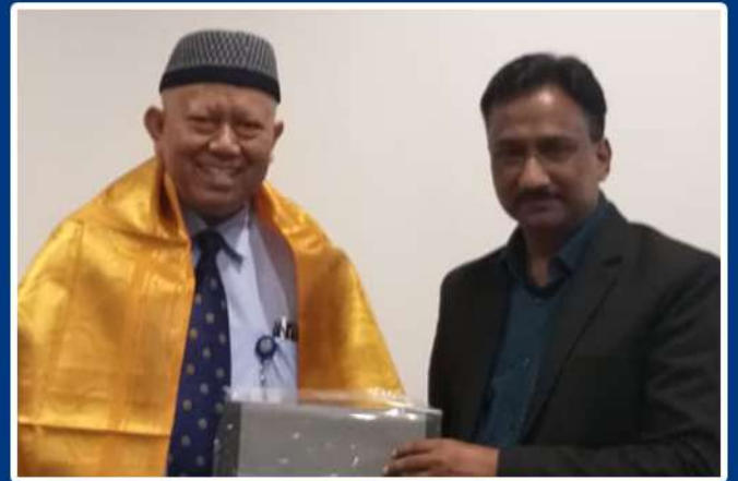
MOA With University Negeri , Indonesia