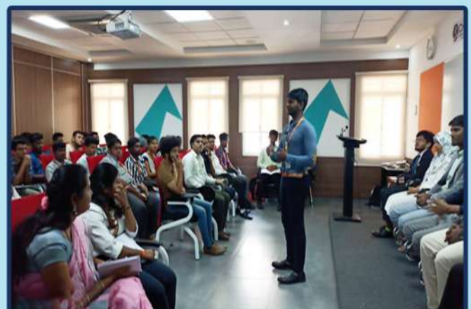
National Management Day Seminar