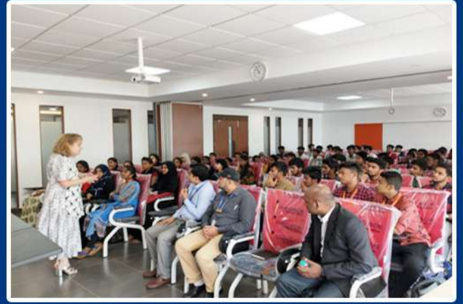
International Guest Lecture By ACCA Faculty