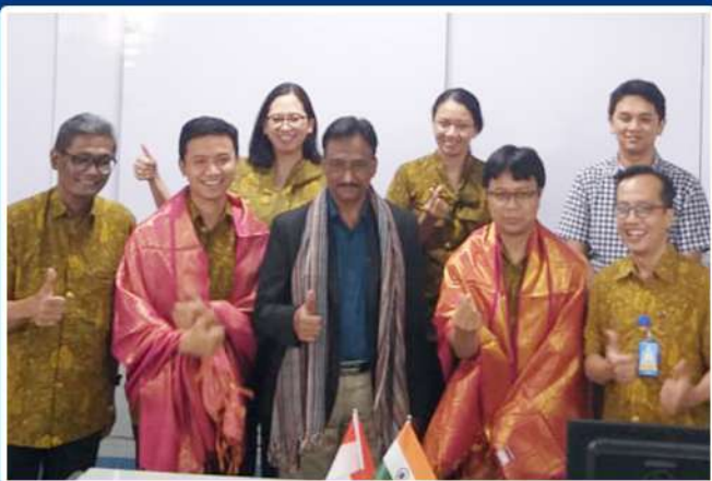
MOU with University Atma Jaya, Indonesia