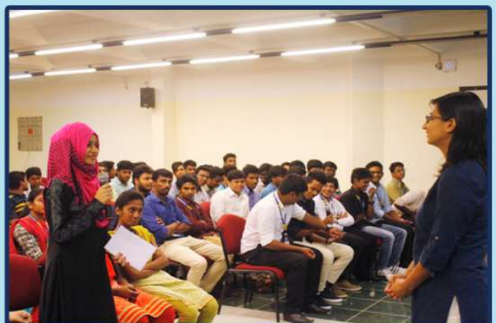
Guest Lecture on Finance