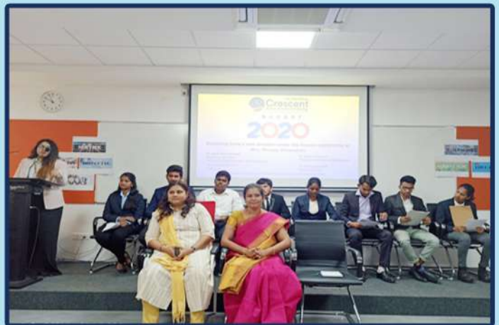
Debate on Budget 2020