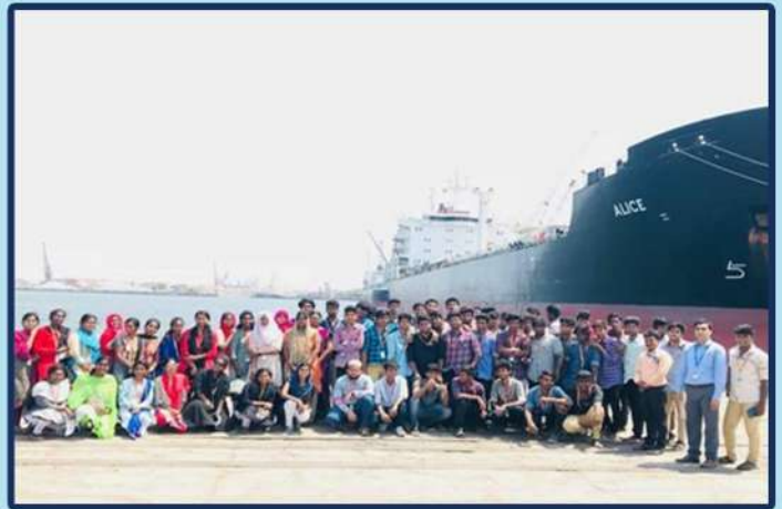
Industrial Visit- Chennai Port Trust