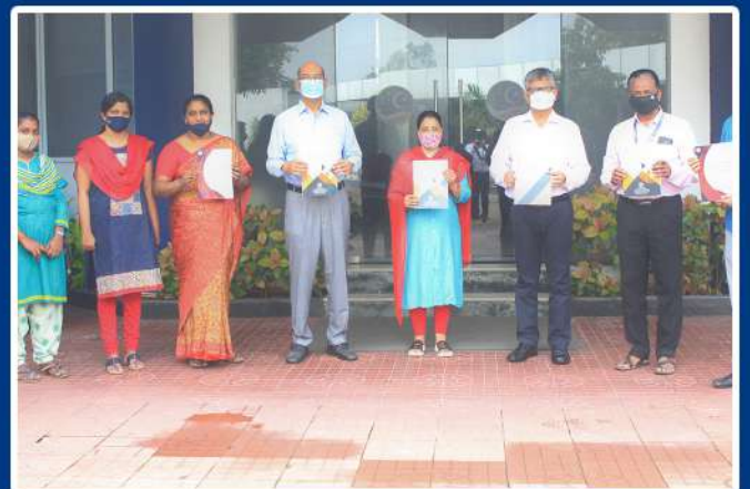
Release of International Journal