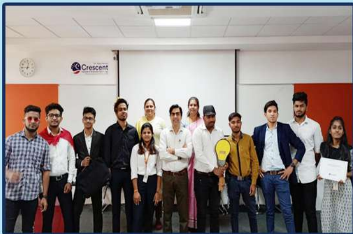
Management Games Team