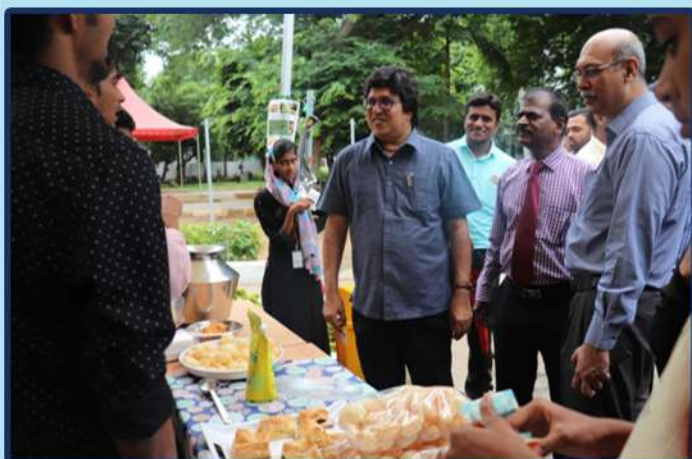
ED Cell Bazaar