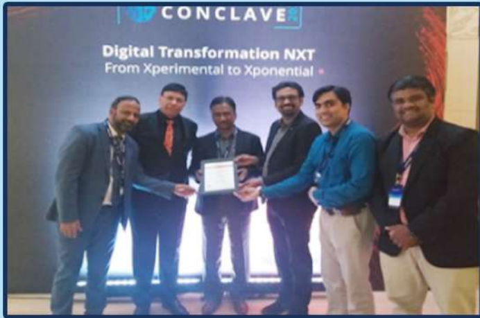
International Conclave with Miles Foundations