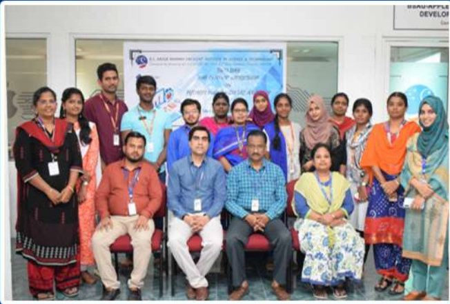
Two Day Workshop on Python