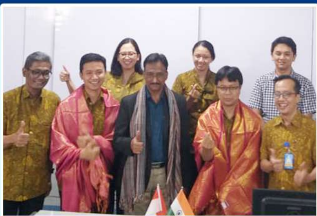
MOU with University Atma Jaya, Indonesia