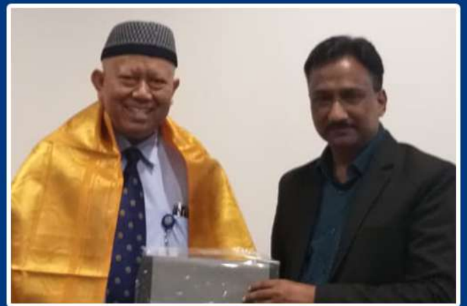
MOA With University Negeri , Indonesia