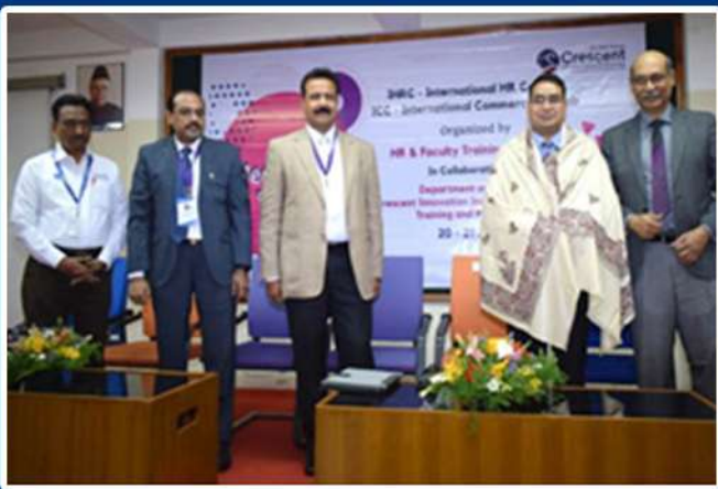
International Conference on HR CON FAB