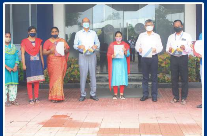
Release of International Journal