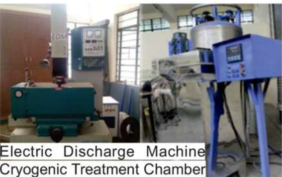
Electric Discharge Machine Cryogenic Treatment Chamber