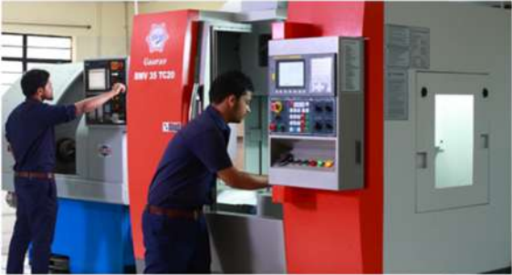
CNC Turning Center, Vertical Machining Center