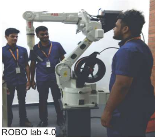
ROBO lab 4.0