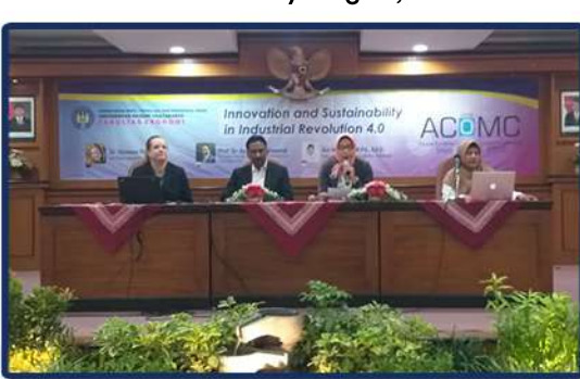
Interantional Conference Yogyakarta