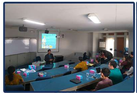
Guest Lecture at University Atma Jaya, Indonesia