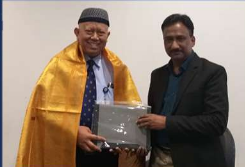
MOA with University Negeri, Indonesia