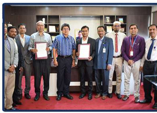
{\bf MOU\ with\ ISDC,\ UK}