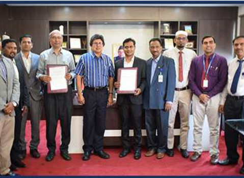
MOU with ISDC, UK