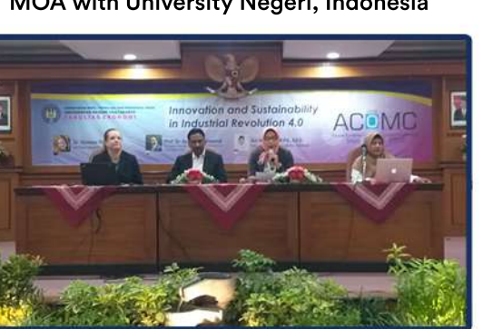
Interantional Conference Yogyakarta