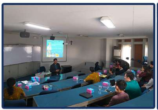
Guest Lecture at University Atma Jaya, Indonesia