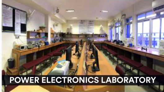
POWER ELECTRONICS LABORATORY