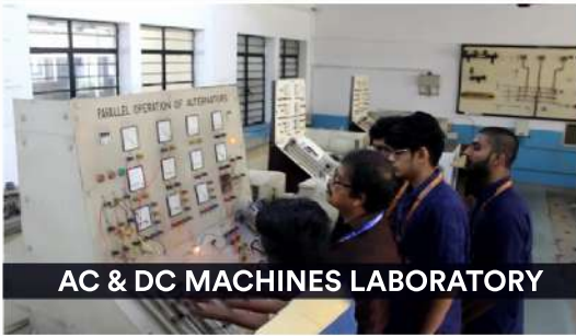
AC & DC MACHINES LABORATORY