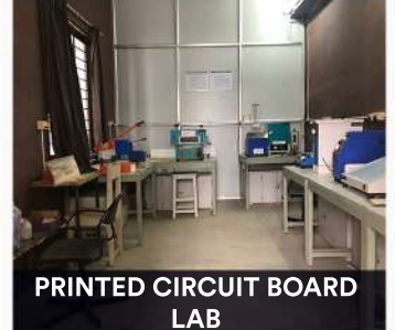
PRINTED CIRCUIT BOARD LAB