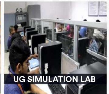
UG SIMULATION LAB