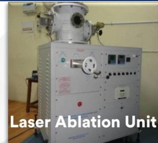
Laser Ablation Unit