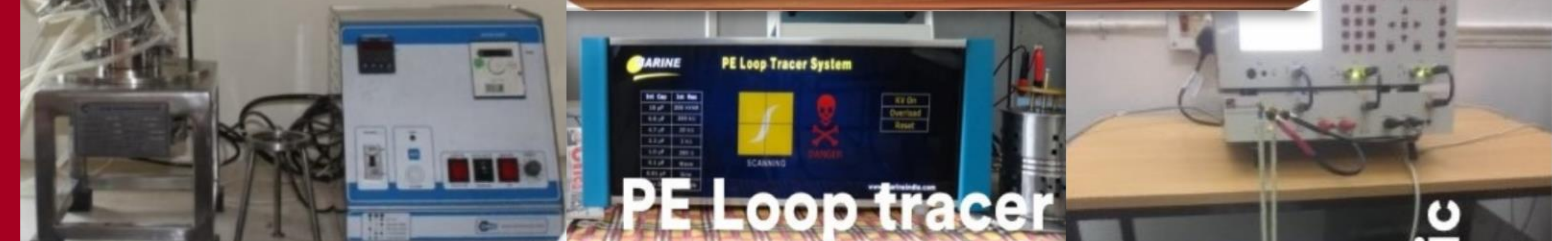
PE Loop tracer