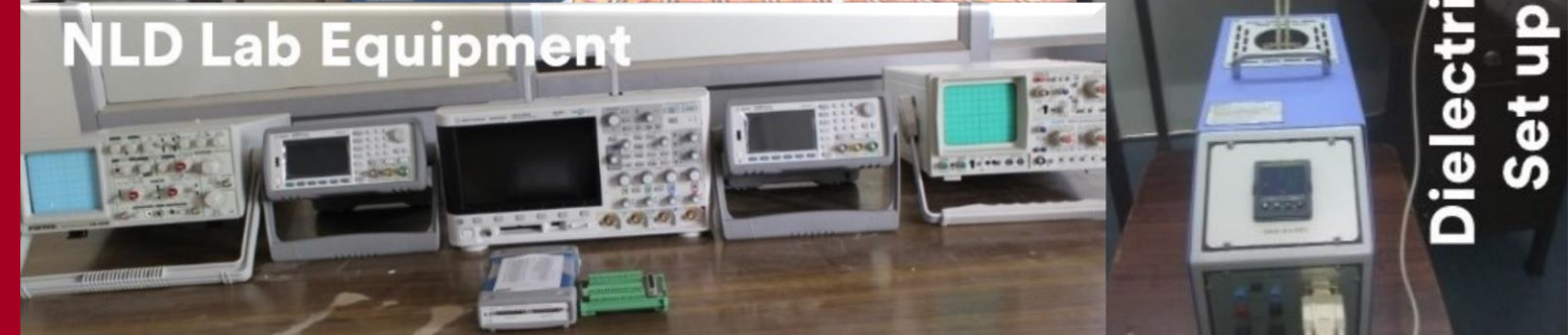
NLD Lab Equipment