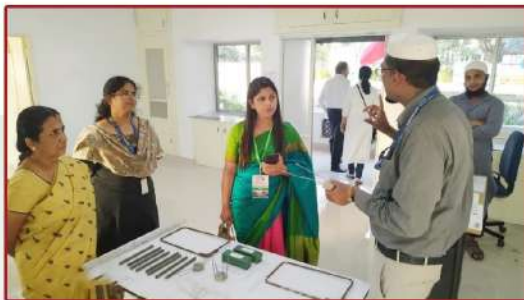
Centre for Prevention and Control of Corrosion in Concrete Structures