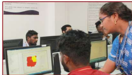
Centre for Remote Sensing and Geographic Information System