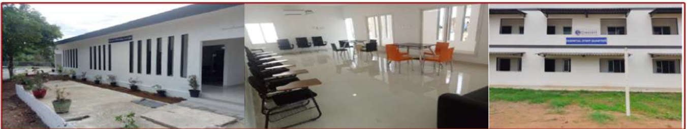
AFFORDABLE HOUSE DESIGNED AND CONSTRUCTED BY CIVIL ENGG DEPT