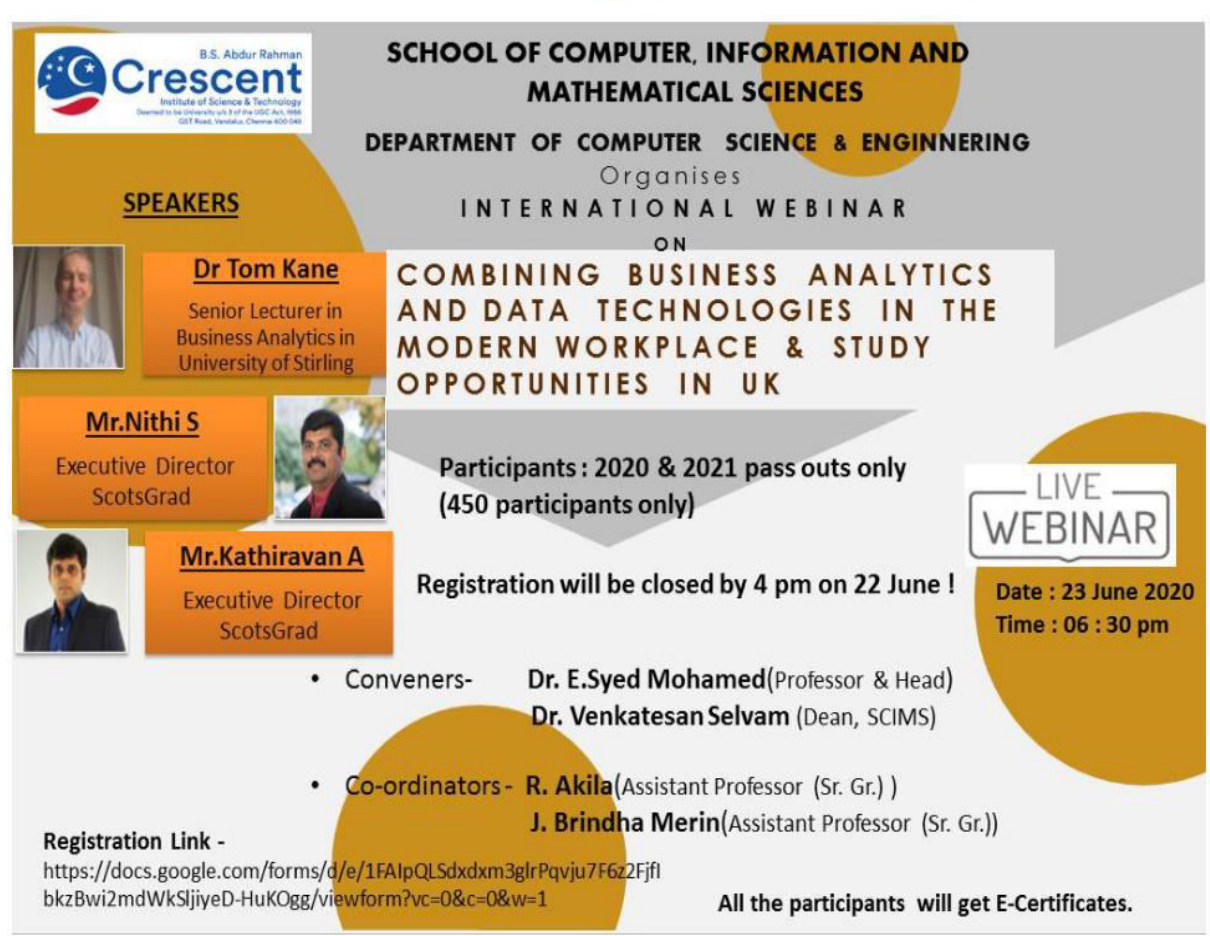
Fig. 1 Study Opportunities in UK Brochure