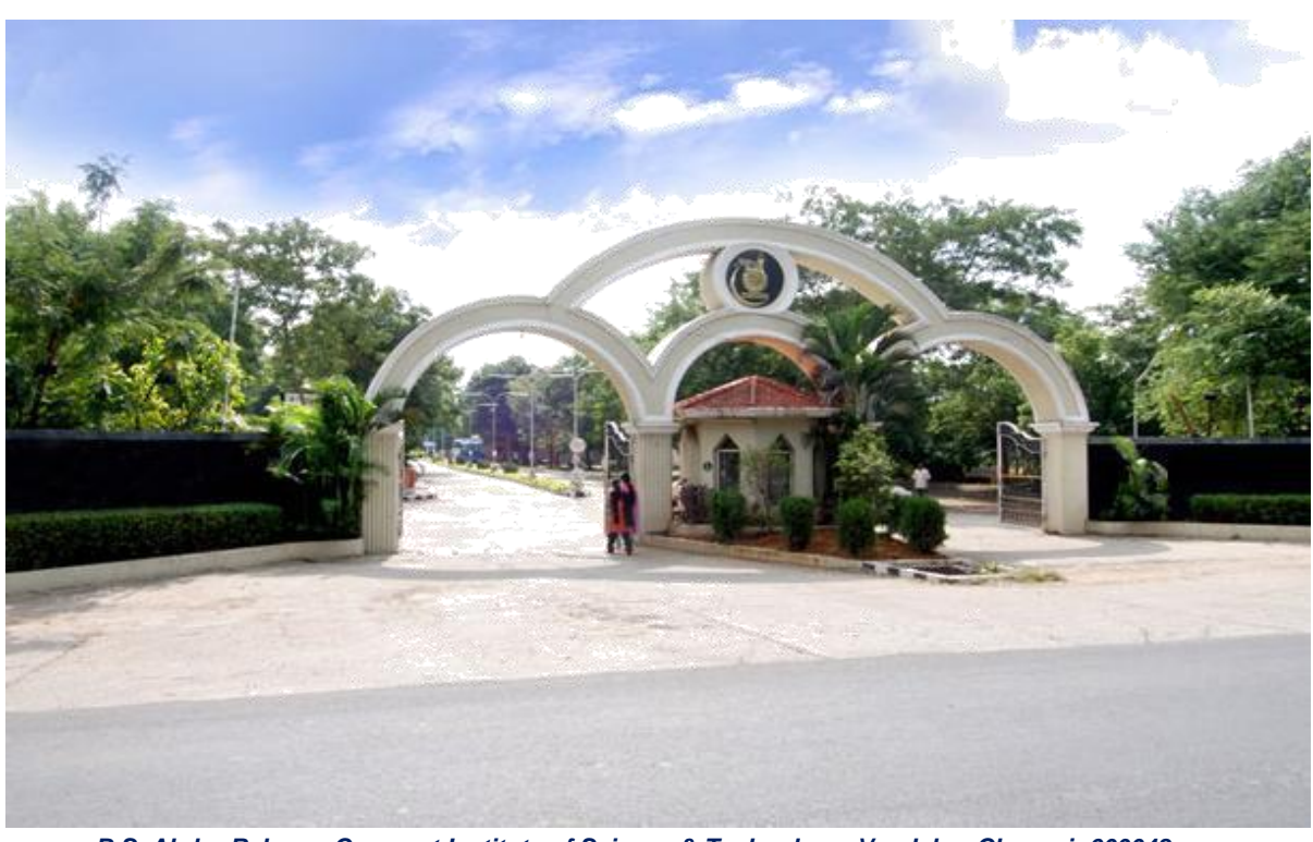
B.S. Abdur Rahman Crescent Institute of Science & Technology, Vandalur, Chennai- 600048.