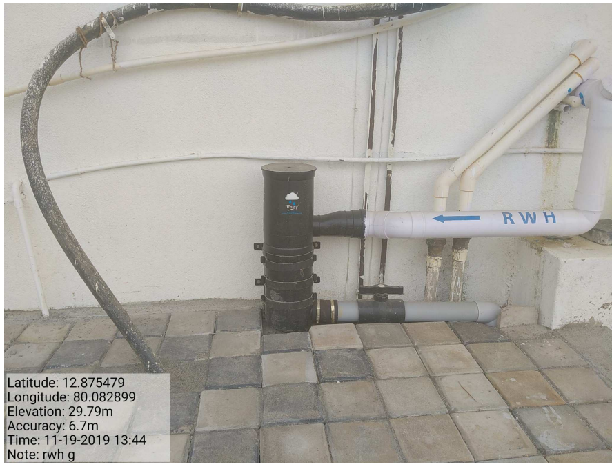
FILTER UNIT IN RAINWATER HARVESTING SYSTEM (ARCHITECTURAL BLOCK)

RAINWATER HARVESTING PIT AT LIFE SCIENCE BLOCK