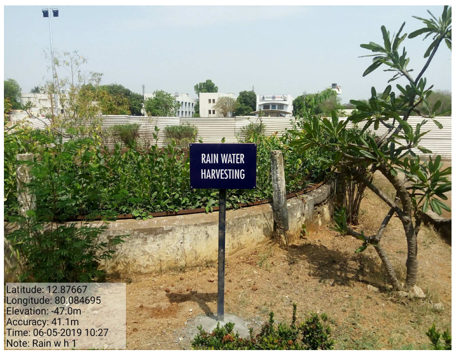
RAINWATER COLLECTION WELL