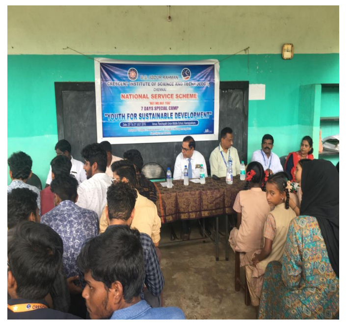
From the Inagural gatherings