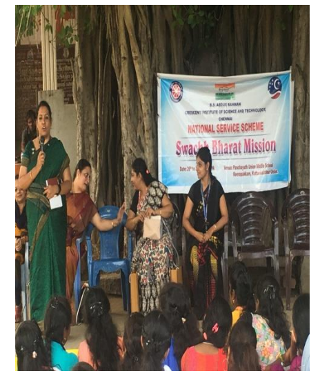
Guest Speaker delivering lecture on healthy food habits.