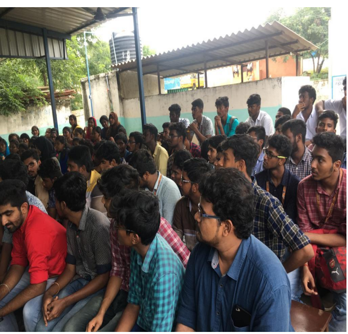
From the NSS special camp inaugural programme.