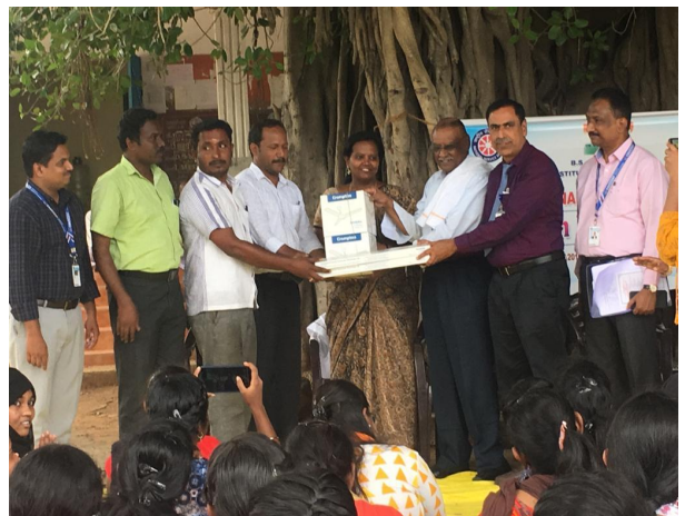
Crescent Institute offering two fans for the Panchayath Union Middle School Keerappakkam.