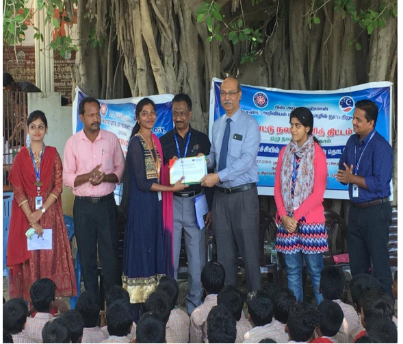
Special camp Certificate Distribution