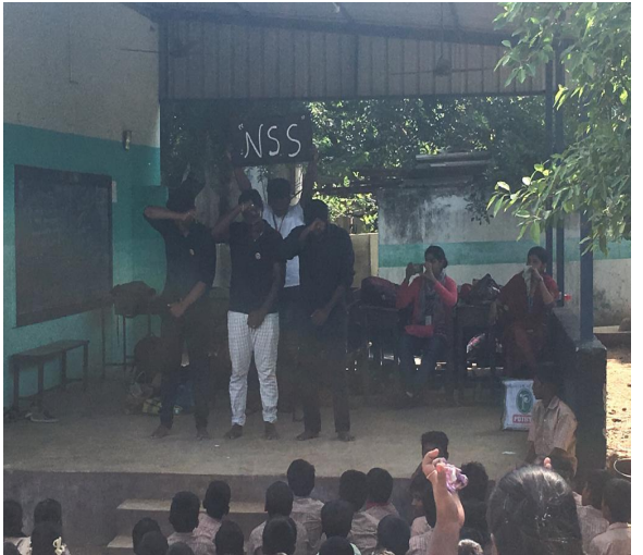
Cultural Programmes by NSS Volunteers.