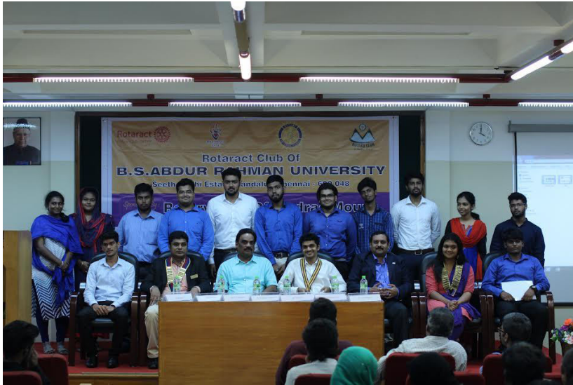
Installation of new office bearers for the year 2016-17