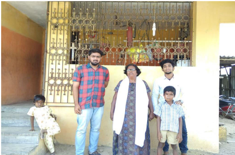
Visit to the Freedom Children's home near Minjur