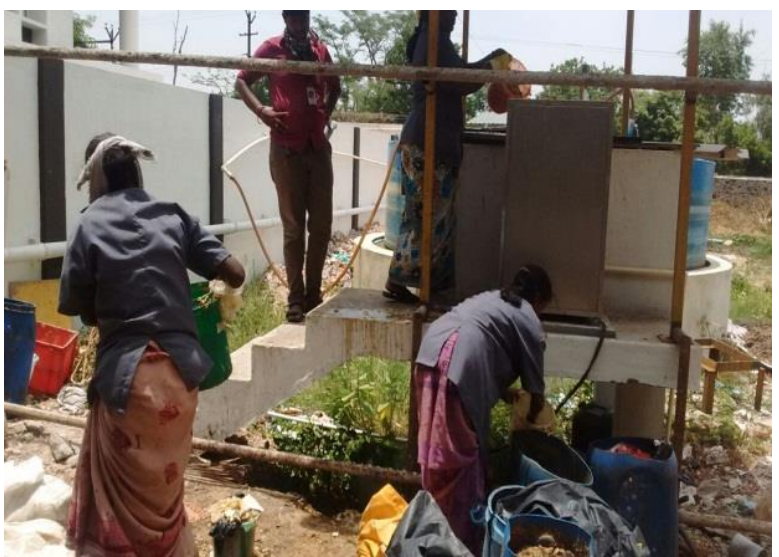
Food waste feed in to Bio gas plant