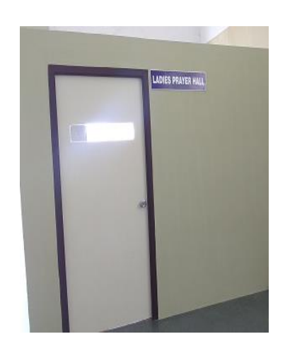
Women's Prayer Hall