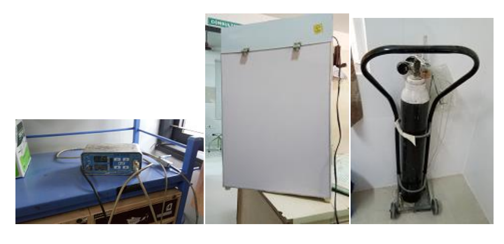
Pulse oxy meter