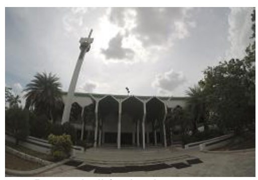
Prayer hall for Institute