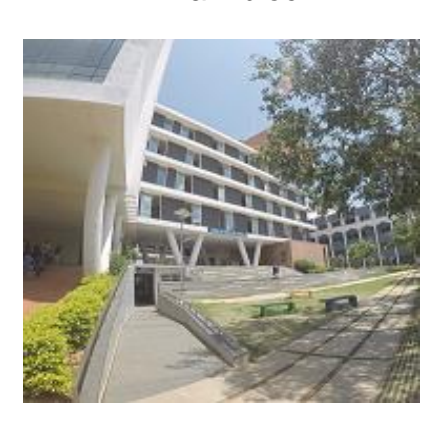
School of Mechanical Science Block