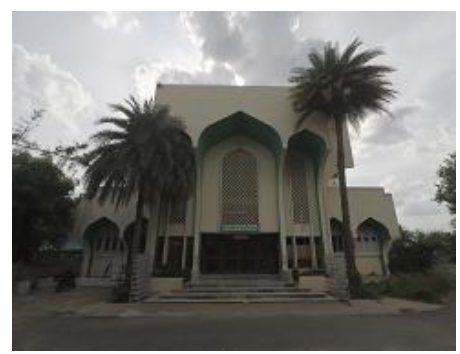
Men's Hostel Prayer hall

In our campus we have 2 prayer halls, one in Men's Hostel and another in Institute campus. For Women we have separate prayer hall in Hostel, Convention Centre & Community hall.