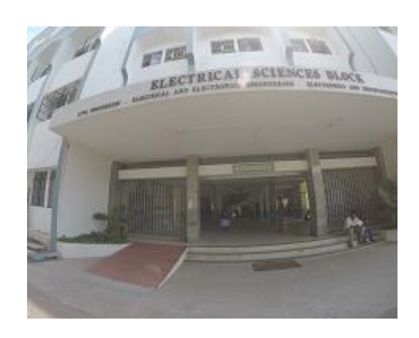
Electrical Science Block

All buildings are constructed with a facility of ramps and lifts for Persons with Disabilities.